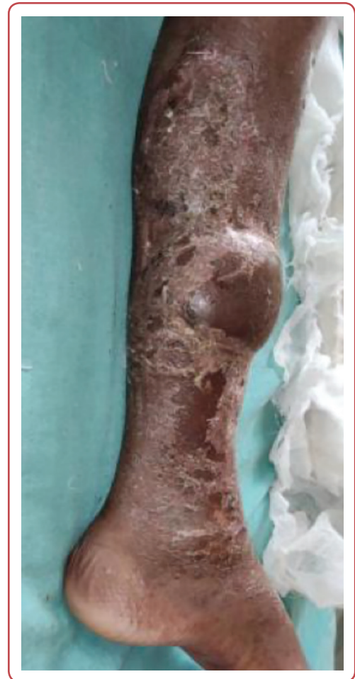
Figure 3: One year after the adoption of the medial gastrocnemius soleus muscle flap due to a crush damage to the middle third of tibial diaphysis in a 12-year-old patient