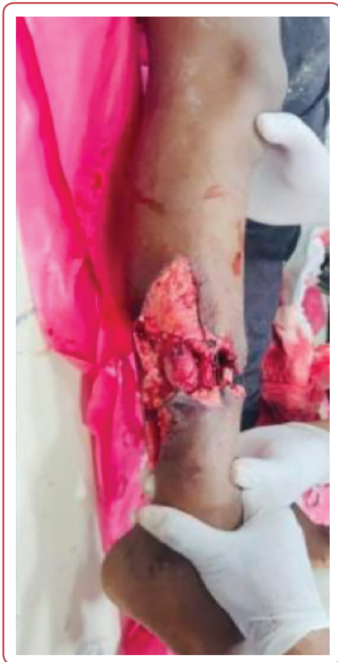
Figure 2: A crush damage to the middle third of tibial diaphysis in a 12-year-old patient