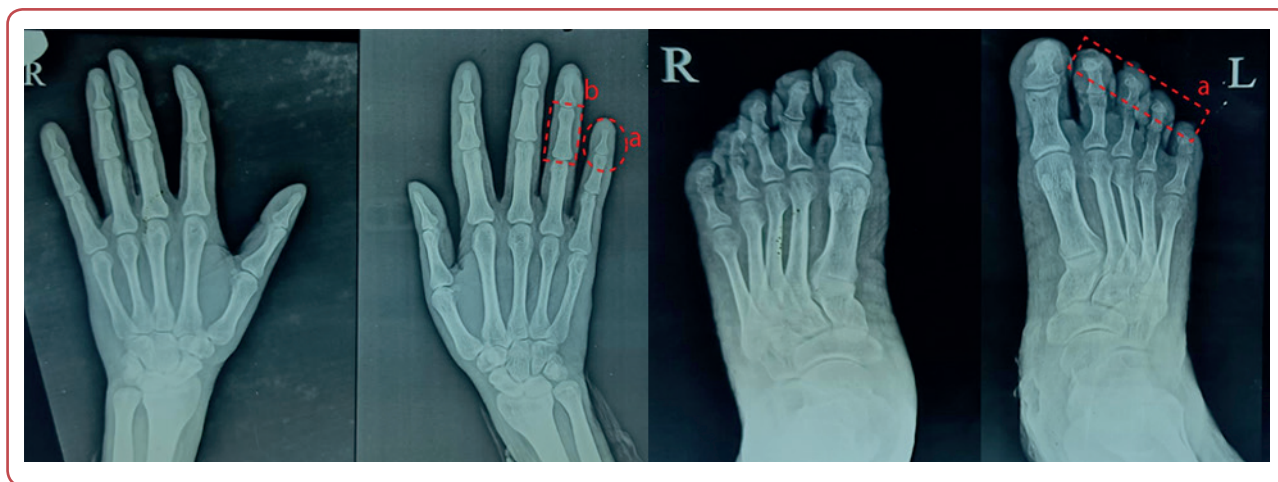
Figure 4: X-ray of the hands and feet (AP) showing: a) resorption of terminal phalanx of 5th digit with subarticular erosion of middle phalanx of left hand, resorption of most of the terminal phalanges of both feet; b) periarticular osteopenia seen in multiple interphalangeal joints of both feet; c) osteoporotic changes associated with cortical thinning seen in middle phalanges of 2nd, 3rd, 4th and 5th digits and metacarpals of left hand.