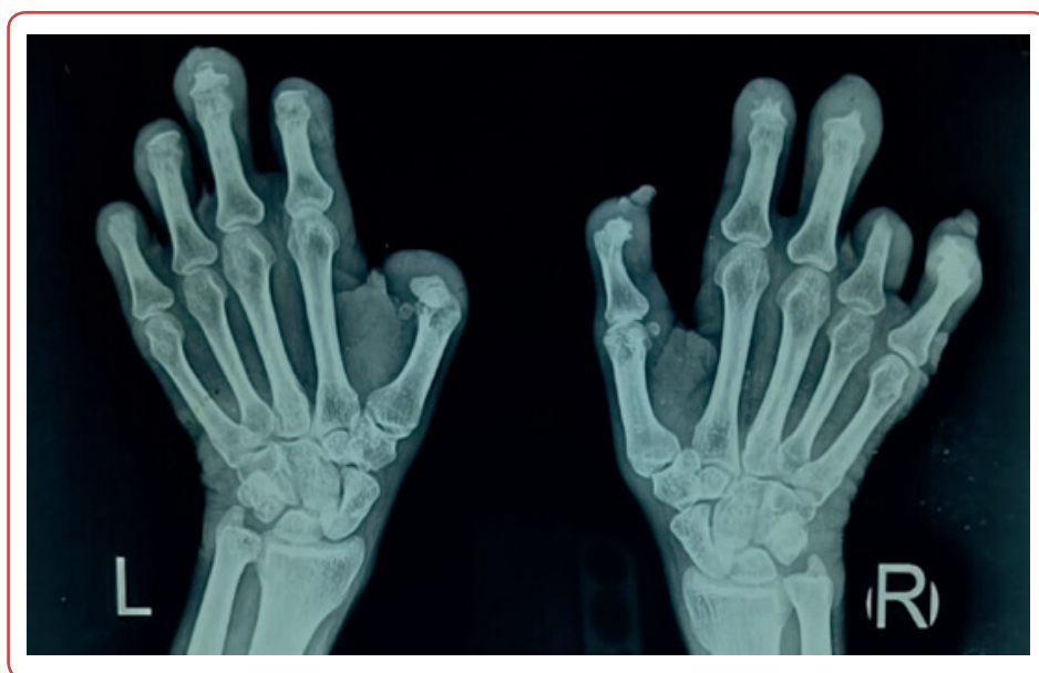
Figure 3: X-ray of hands and wrist joint (AP) of a patient with lepromatous leprosy (LL) showing: complete resorption of all terminal phalanges of both hands, partial resorption of all middle phalanges of both hands except the 4th digit of the right hand which shows complete resorption along with partial resorption of proximal phalanx. Soft tissue thickening also seen in digits of both hands with periarticular osteopenia.