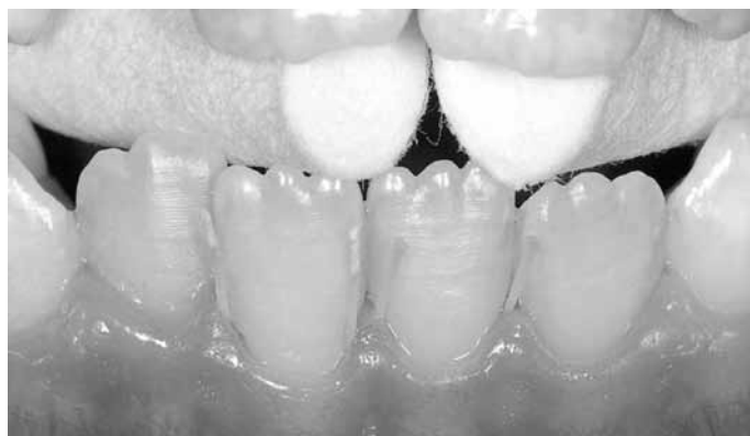
Figure 1. The gingival crevicular fluid collection. Four samplings were performed at the mesial and distal aspects of each of the mandibular central incisors by using endodontic #25 standardized sterile paper strips.

(mesial, distal, medio-buccal and medio-palatal/lingual), as previously described. 10 Briefly, the presence of supragingival plaque (PL+), the gingival bleeding within 15 sec. after probing (BOP+), and the probing depth (PD) were recorded. A single expert examiner collected the clinical data in all subjects. Contamination of the GCF was minimized by recording the PL+ before carefully cleaning the tooth with a sterile curette, then by collecting GCF and subgingival plaque from the isolated area, and finally by recording the PD and BOP+. The GCF collection was performed at both the mesial and distal sites on each of the lower central incisors as previously described. 10,11 Briefly, endodontic #25 standardized sterile paper strips (Inline; Torino, Italy) were inserted 1mm into the gingival crevice and left in situ for 60 sec. (Figure 1). These four samples were pooled, were transferred to plastic vials and immediately stored at -80°C, until analyzed.