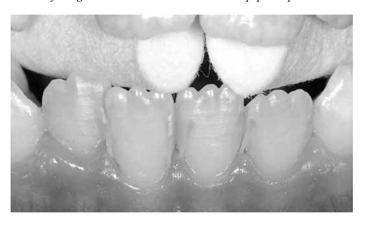
Figure 1. The gingival crevicular fluid collection. Four samplings were performed at the mesial and distal aspects of each of the mandibular central incisors by using endodontic #25 standardized sterile paper strips.

(mesial, distal, medio-buccal and medio-palatal/lingual), as previously described. <sup>10</sup> Briefly, the presence of supragingival plaque (PL+), the gingival bleeding within 15 sec. after probing (BOP+), and the probing depth (PD) were recorded. A single expert examiner collected the clinical data in all subjects. Contamination of the GCF was minimized by recording the PL+ before carefully cleaning the tooth with a sterile curette, then by collecting GCF and subgingival plaque from the isolated area, and finally by recording the PD and BOP+. The GCF collection was performed at both the mesial and distal sites on each of thelower central incisors as previously described. <sup>10,11</sup> Briefly, endodontic #25 standardized sterile paper strips (Inline; Torino, Italy) were inserted 1mm into the gingival crevice and left insitu for 60 sec. (Figure 1). These four samples were pooled, were transferred to plastic vials and immediately stored at -80°C, until analyzed.