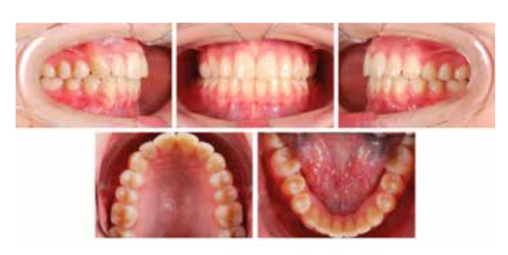
Figure 8. Patient after 12 months of follow-up when she was 15 years and 5 months old.

The timing of intervention for maxillary molar distalization in relation to the presence of second and third molars has been a matter of debate over the last few decades.<sup>17-22</sup> Before the advent of skeletal anchorage, a recommendation was to distalize before the eruption of the second molars,<sup>19</sup> even though recent evidece<sup>18</sup> has shown that the presence of erupted second molars (eventually along with unerupted third molars) would not have major effects on the degree of distalization (irrespective of the use of skeletal anchorage). Considering this piece of evidence<sup>18</sup> in combination with the use of skeletal anchorage, current