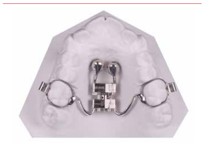
Figure 1. The MaXimo appliance (reprinted with permission from Perinetti et al.<sup>14</sup>)

The Leaf Expander<sup>®</sup> screw (Leone Orthodontics and Implantology, Sesto Fiorentino [FI], Italy) has been designed for slow and maxillary expansion.<sup>12</sup> However, its constant force release by a discontinued activation makes it a good candidate for a distalizing tool, where optimal force delivery for tooth movement has to be uninterrupted and constant.<sup>13</sup> This case report describes