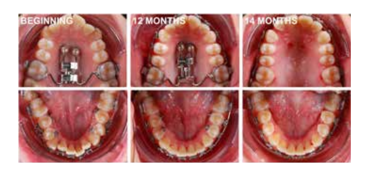
Figure 4. Maxillary occlusal views of treatment progress from beginning to 14 months of treatment when the MaXimo and miniscrews were removed (modified with permission from Perinetti et al.<sup>14</sup>).