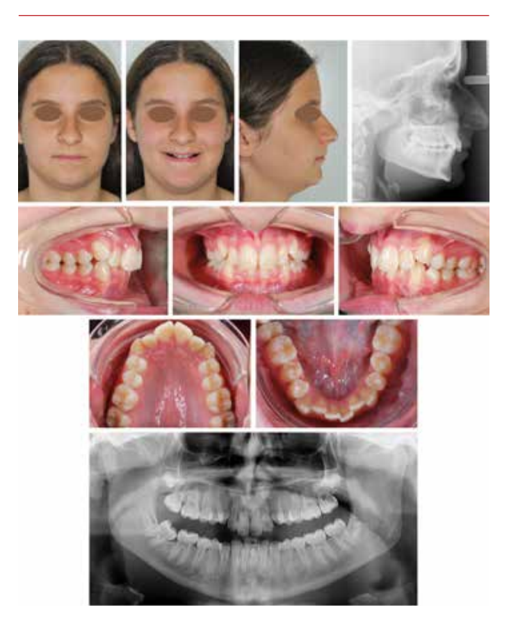
Figure 2. The 13 years, 2 months old female patient with dental Class II malocclusion, increased overjet and overbite before treatment (modified with permission from Perinetti et al.<sup>14</sup>).

A 13 years, 2 months old female (Figure 2) presented with a dentoskeletal Class I malocclusion, a bilateral half-cusp Class II molar relationship, and increased overbite and overjet, along with a noteworthy dental crowding in both arches. Her medical history was not contributory. Soft tissue profile and cephalometric analysis showed a very slight tendency towards a skeletal Class II malocclusion (ANB, 3.1°; Wits appraisal, 2.3 mm) associated to a bi-maxillary retrusion (A to N perp., -1.0 mm and Pog to N pepr., -5.4 mm) (Figure 2; Table 1). A reduced vertical growth pattern (SN to GoGn, 25.8°) was also seen with no major