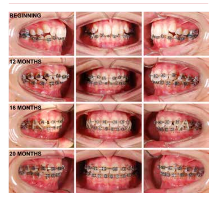
Figure 5. Frontal and lateral views of treatment progress from beginning to 20 months of treatment (modified with permission from Perinetti et al.<sup>14</sup>).

skeletal transverse maxillary deficiency (Figure 2). A panoramic radiograph revealed the presence of all of the third molars and no other anomalies. At the moment the patient presented second molars were fully erupted (Figure 2). Orthodontic treatment was started immediately by means of a bilateral MaXimo appliance (900 g, code A2704-09, Leone Orthodontics and Implantology,) in combination with multibracket appliance. Written informed consent was obtained from the parents of the patient for publication of this case report and accompanying images.