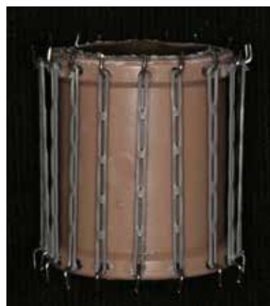
Figure 1. Elastics setting device

Descriptive statistics were employed and data were expressed as mean and standard deviation or median and interquartile range. Normality was accessed with the Shapiro-Wilk test. The Friedman test or ANOVA for repeated measures were used to evaluate in each group the strength degradation of the orthodontic elastics over time. The t-test for independent variables was used to test the differences between the groups at each moment. The level of significance was set at 5% ( \alpha = 0.05 ). The data were tabulated and analyzed in IBM SPSS Statistics for Windows (IBM SPSS, 21.0, 2012, Armonk, NY: IBM Corp.).