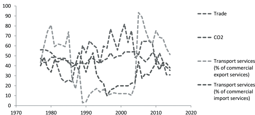
Figure 1. Trend Analysis of Trade, CO2 and Transport Services