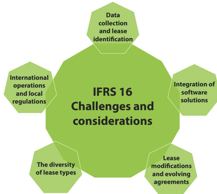
Figure 1. IFRS 16 Challenges and Considerations

One of the foremost challenges in implementing IFRS 16 lies in the collection of lease-related data (Magli et al. , 2018). Hotels must gather a comprehensive inventory of lease agreements, encompassing both property leases and equipment leases. The diverse array of services embedded within these agreements necessitates meticulous identification of lease components. The inclusion of various service elements, often intertwined with lease payments, demands a granular understanding of contractual terms and an ability to distinguish between lease and non-lease components.