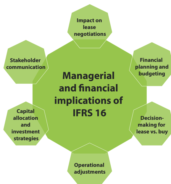
Figure 2. Managerial and financial implications of IFRS 16

The intersection of IFRS 16 with hotel lease accounting extends beyond financial statements, exerting influence on managerial decisions, strategic planning, and operational considerations (IFRS,2023). The recognition of lease obligations on the balance sheet brings forth a cascade of implications that hotels must navigate while ensuring the seamless delivery of exceptional guest experiences. The upcoming figure will illustrate the Managerial and financial implications of IFRS 16.