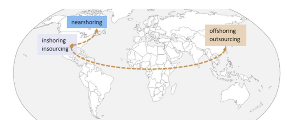
Figure 1. Display of offshoring, nearshoring and offshoring distance

In order to offer clients high-quality goods at competitive prices, two sets of activities and business processes work together. Throughout the many stages of