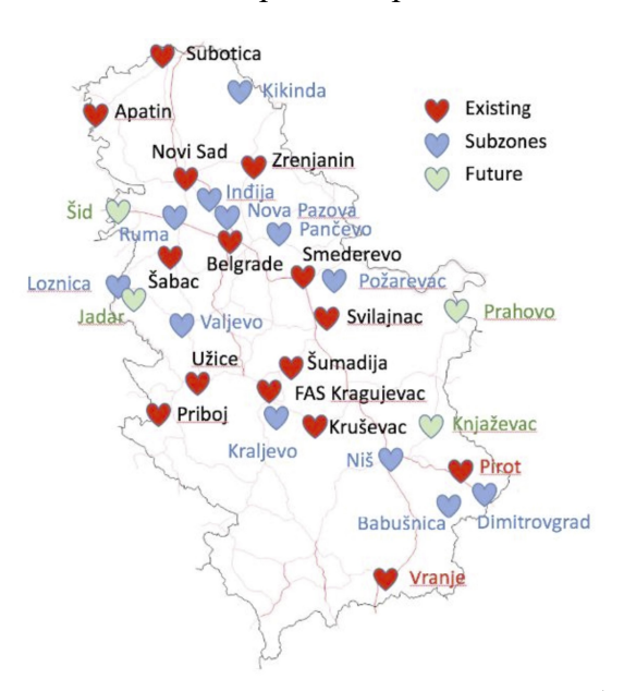
Figure 2. All free zones location in Serbia (Simonović & Kostić, 2022)

Almost every nation in the world has a highly developed idea of free zones. It is crucial to note that while the idea of modern free zones is growing and receiving a lot of attention in the modern era, the fundamentals of free trade have been around for millennia and the first free zones are established at the free ports of Grecian and Roman times. The