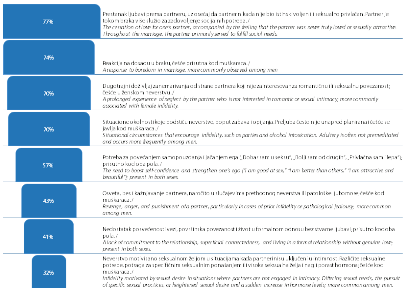
Slika 1. Šta istraživanja govore: Zašto se pojavljuje neverstvo?