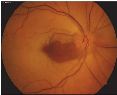
Fig. 1 – Early fundoscopic findings (7 days from central retinal artery occlusion).