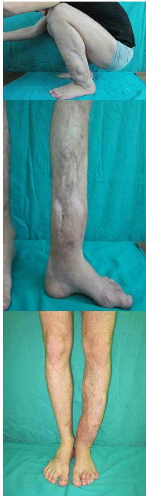
Fig. 7 – The condition of the lower leg after the completion of treatment.

patient was walking without mobility aid. Movements in the left ankle were limited at the medium level. At the site of the residual part of the pin of the external skeletal fixator there was no secretion. Figure 7 present the condition of the lower leg after the completion of treatment.