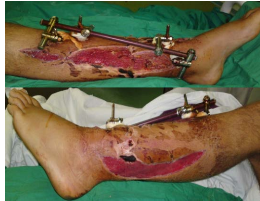
Fig. 4 – Soft tissue defects of the lower leg and the presence of the wound caused by fasciotomy.

In the postoperative period, there was a very slow secondary recovery of the soft tissue defects of the lower leg, which were at the stage of mature granulation and absent infection, covered by skin autograft (Figures 4 and 5).