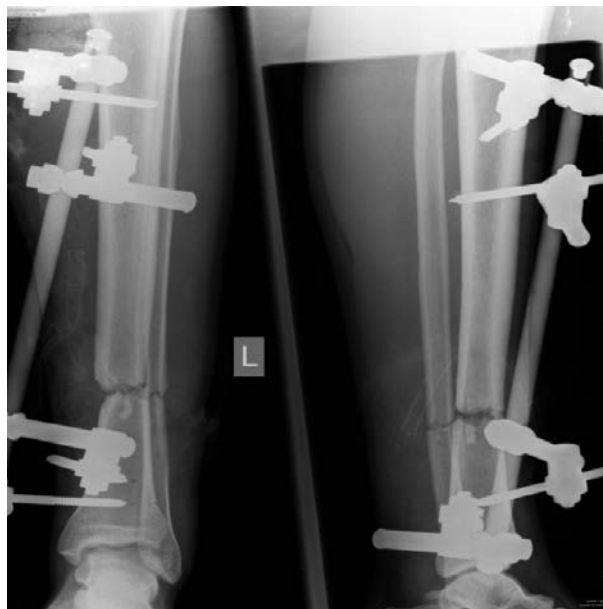
Fig. 1 – Open fracture of the left lower leg after reposition of the fragments of the tibia and external skeletal fixation.

Due to the technical reasons, an arteriography of the injured limb has been done right after the external fixation of the fracture. Arteriography verified discontinuity of all three lower leg arteries at the level of the fracture line (Figure 2). The patient, after consulting a vascular surgeon, was instantly taken into the Department of Vascular Surgery.