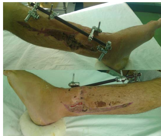
Fig. 5 – The state of the lower leg after soft tissue defect covering.

Due to the difficulty in walking, limited mobility of the ankle and the toes of the left foot, swelling of the foot and weakness of the muscles of the left lower leg, the patient was taken into the Department of Physical Medicine and Rehabilitation.