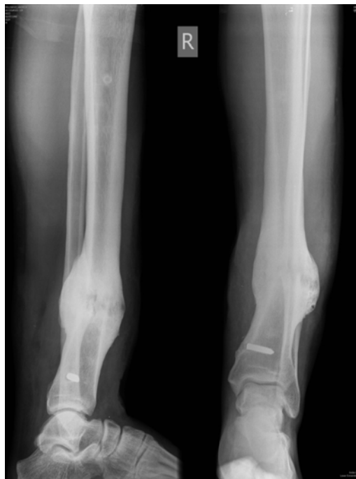
Fig. 6 – The X-rays of the left lower leg present the healed fracture of the left tibia with valgus deformity and partly broken pin of the external skeletal fixator, which was not removed from the tibial bone.

On the control X-ray examination of the left lower leg with ankle, which was made on May 25, 2011, the fracture of the most distal pin of external skeletal fixator was visible, besides the healing of fractures of the tibia with angular deformity – valgus of 10 degrees. Valgus deformity was the result of loosening pins of the external skeletal fixator and fracture of the distal pin of the external skeletal fixator (Figure 6).