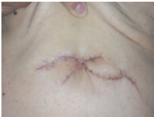
Fig. 5 – One month after radical surgery with reconstruction by skin flaps.