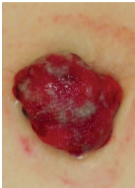
Fig. 2 – The close-up photography of the tumor.