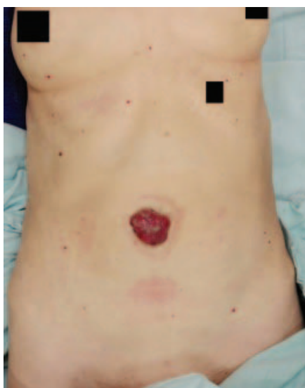
Fig. 1 – Oval, nodular, red, giant tumor of the umbilicus.

Female patient, aged 65 years, was admitted to the Center for Plastic Surgery in the Clinical Centre "Kragujevac" with vegetant umbilical skin tumor. According to the patient's explanation, the tumor existed for about 6 months, had rapid growth and was treated by a dermatologist. The tumor was red, oval, partly with a irregular surface, measuring 38 × 18 mm and it was most similar to a pyogenic granuloma (Figures 1 and 2). The tumor involved the umbilicus and a part of the skin, on the right side. Axillary and groin nodes were not palpable and the chest X-ray was normal. The excision was done, 0.5 cm from the edges of the tumor, deep to the fascia and the tumor with healthy surrounding tissue was sent to a histological examination. The wound was closed by a advancement skin flap. The part of the flap was shaped and sutured by buried stitches, in order to achieve a satisfactory cosmetic result. The postoperative course was normal, and the stitches were removed after ten days (Figure 3).