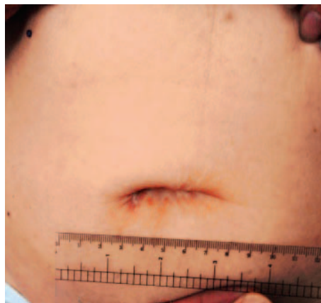
Fig. 3 – The umbilical region, ten days after the surgery.

The histopathological finding was: primary skin melanoma (Figure 4) of a nodular type, with depth of invasion: Clark V, Breslow 10 mm. The spindle-type cancer cells dominated, with no detectable melanin pigmentation. There were superficial ulcerations, larger than 6 mm, invasion of the lymphatic vessels, capillaries and the proliferation of moderate-stromal mononuclear reaction. Tumor cells were positive for vimentin, S-100 protein, melan-A and HMB-45, and negative for EMA, with moderately high proliferative activity (about 35% of the cells were Ki-67 positive). Histopathological examination showed that deep and lateral margins were clear. Further course included detailed systemic examinations for melanoma. Stadium of the disease was: pT4b, No, Mo. Lymphoscintigraphy findings (Sentinel lymph node mapping – SLNM) was regular. After the consilium decision, radical excision was done, 2 cm from the scar, and deep to the peritoneum, with primary reconstruction of the umbilical area with local skin flaps (Figure 5). Postoperative course was regular. The histological examination showed clear resection margins. Conclusion of the con-