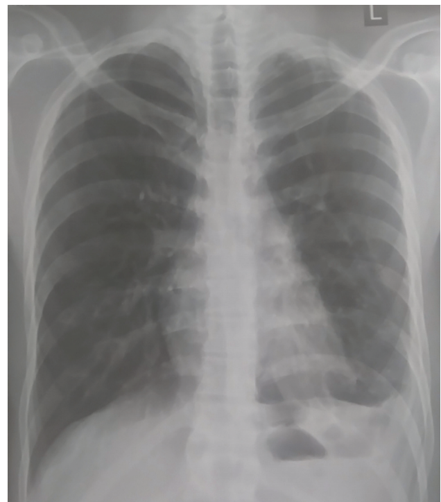
Fig. 5 – Radiography of the lung and heart at the time of discharge.

stable. Due to delayed lung reexpansion, another thoracic tube was placed ten days after the VATS procedure, which resulted in prolonged hospitalization. As control radiography showed total reexpansion of the left lung, the tubes were removed after the clamping probe (Figure 5). The patient was discharged in good general condition after 22 days of hospitalization.