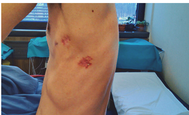
Fig. 4 – The sites where ports and thoracic tubes were placed.

The patient was admitted to the surgical intensive care unit, where he underwent thoracic tube placement. By the next morning he had drainage of 400 mL of hemorrhagic fluid. The patient remained hemodynamically stable and the following day he was referred to the Clinic for Chest Surgery of the Military Medical Academy. During the afternoon hours his blood pressure dropped as well as his hemoglobin and hematocrit levels. Under the circumstances, a VATS exploration was performed under general anesthesia. Two incisions were made on the left side of the thoracic wall – one in the VIII intercostal space at the posterior axillary line, and the other one in the IV intercostal space at the anterior axillary line (Figure 4).