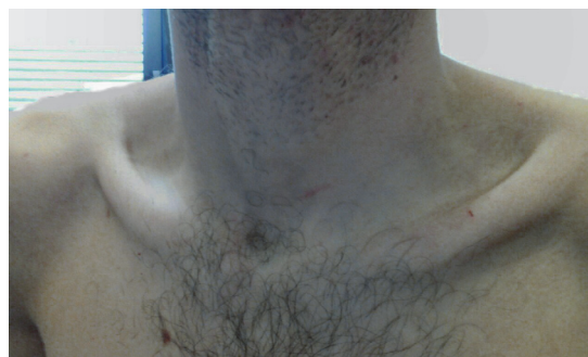
Fig. 1 – Location of the neck wound.

The patient was a 28-year-old male who was stabbed with broken glass penetrating the front side of the neck (zone I injury) the night before admission to our clinic. The next day the patient was examined at the Emergency Department in charge of surgical admissions at the Military Medical Academy in Belgrade. A linear 2 cm laceration was noted in the zone I of the neck with no active bleeding. There was an interruption of skin and subcutaneous tissue to the muscle layer (Figure 1). An otorhinolaryngologist performed rhinoscopy, oropharyngoscopy and indirect laryngoscopy to rule out any injuries of the ear, nose and throat region. Due to complaints of chest pain and dyspnea, a chest radiography (Figure 2) and MSCT of the thorax were taken. They revealed pneumomediastinum and hemopneumothorax on the left, as well as subcutaneous emphysema (Figure 3).