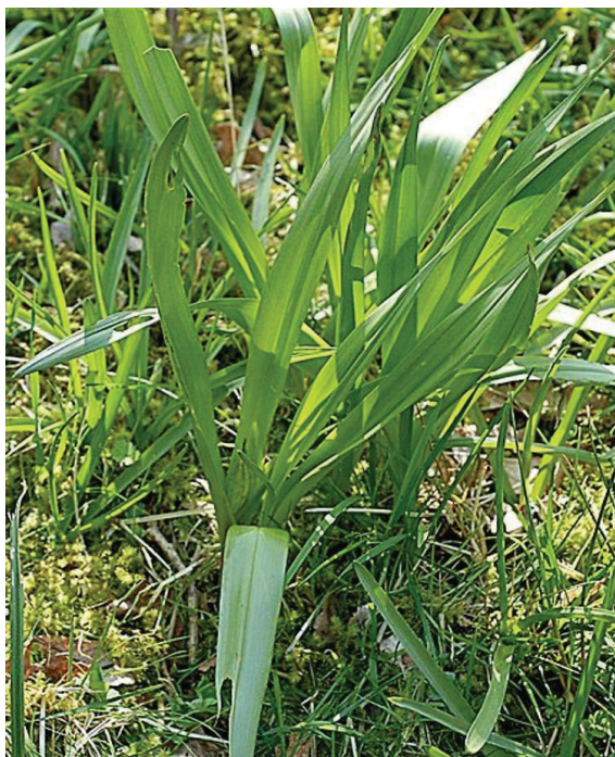
Fig. 1 – Meadow saffron ( Colchicum autumnale L.).

Meadow saffron ( Colchicum autumnale L.), (Figure 1) is a perennial herbaceous plant from the Lily family ( Liliaceae ). It is commonly known as autumn crocus, wild saffron, naked lady, son before the father. Its flower is very similar to the flower of saffron ( Crocus sativus L.), it has no special smell and is spread over mountain meadows and pastures. Meadow saffron seems like the edible wild garlic ( Allium ursinum L.) (Figure 2), commonly called “sremush” in Serbian, which has specific garlic like smell 1 . The toxic substance found in meadow saffron is alkaloid colchicine. Colchicine poisoning is a very dangerous condition and a fatal outcome is one of possible consequences. An antidote for this substance does not exist yet, but there are possibility of colchicine specific monoclonal antibodies to be used in future 2 . All parts of the plant are poisonous and contain colchicine, but the highest concentration of this alkaloid is in seeds (0.2–0.8 %) and bulbs (0.4–0.6 %), while it is low in leaves. There are some other toxins present in meadow saffron, but they are less dangerous to humans 1 . Colchicine is also used in medicine for the treatment of gout 3 , Mediterranean fever 4 , sarcoidosis 5 , scleroderma 6 , amyloidosis 7 , Behcet's disease 8 , Paget's disease 9 , psoriasis 10 , cutaneous vasculitis 10 , alcoholic cirrhosis of the liver 11 and primary biliary cirrhosis 12 .