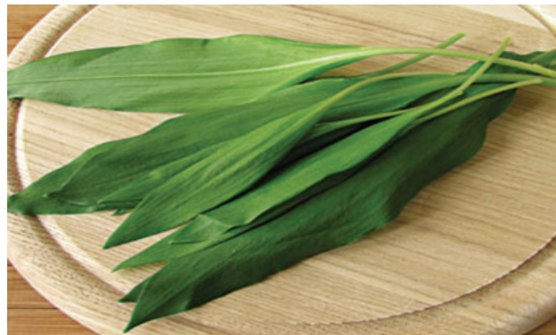
Fig. 2 – Wild garlic ( Allium ursinum L.).