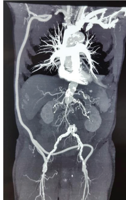
Fig. 3 – Multislice computed tomography angiography with patent axillo-bifemoral bypass and all visceral arteries, and with no liquid collections, gas or hematomas.

otic therapy (vancomycin, ceftriaxone, metronidazole) was used for 15 days, followed by ceftriaxone and metronidazole in next 15 days. Ciprofloxacin ( per os ) was used in the next month. Three weeks after operation, a control MSCT angiography was done. Patent bypass, both aortal stumps with patent all visceral arteries, and no liquid collections, gas or hematomas were found (Figure 3).