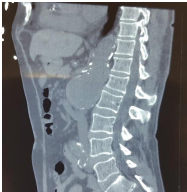
Fig. 1 – Multislice computed tomography angiography of suprarenal aneurysm, 9.5 cm x 8 cm, and previous reconstruction of abdominal aneurysm with Dacron N°XVIII tubular graft.

5.72 \times 10^{12} /L), hemoglobin (Hgb) 107 g/L (normal values 130–160 g/L), hematocrit (Hct) 0.33 L/L (normal values 0.35–0.53 L/L). On urgent esophagogastroduodenoscopy (EGDS) there were empty stomach with no signs of active bleeding. The same finding was in the duodenum, in parts D1 and D2, with no active bleeding from distal part of the duodenum. A gastroenterologist prescribed him H2 blockers with diet and the patient dismissed home. In the evening, he came back complaining of pain in upper parts of the abdomen, nausea, hematemesis and melena 3 times in that afternoon. On exam he had pain in the abdomen on palpation, with clear peristaltic. On rectal exam, a clot of dark blood was found. In laboratory tests there were a small drop of Er ( 2.92 \times 10^{12} /L, Hgb (94 g/L) and Hct (0.29 L/L). The patient had episode of hematemesis (about 300 cm 3 ) in the infirmary. On urgent multislice computed tomography (MSCT) angiography with contrast, an enlarged visceral part of the aorta, near the proximal anastomosis of earlier reconstruction or suprarenal aneurysm, 9.5 cm wide and 8 cm long, was found (Figure 1).