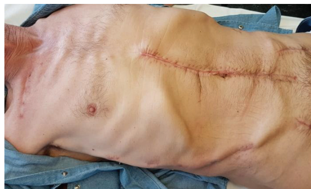
Fig. 4 – All skin wounds were closed with no signs of infection three months after operation.

After closing of all skin wounds and removing of wound stiches, the patient was dismissed on 35th day after operation in a good condition. Few days after operation the patient had mild headache and dizziness in up-right position, but after several days these symptoms gone. Three months after the first control exam, the patient was with good patency of bypass and normal gastrointestinal function. All skin incisions were without signs of infection (Figure 4).