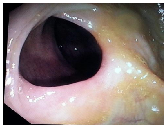
Fig. 3 – Discontinuation of the non-steroidal antiinflammantory drug: a marked improvement in the colonic mucosa on the second colonoscopy.