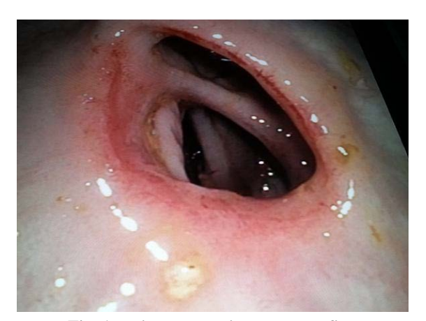
Fig. 1 – Diaphragm disease on the first colonoscopy.

A 56-year-old female was referred to a gastroenterologist due to a positive iFOBT: 477.173 ng/mL (reference value 0–99) performed in the National Colorectal Cancer screening program for the average-risk population. Physical examination and laboratory findings were