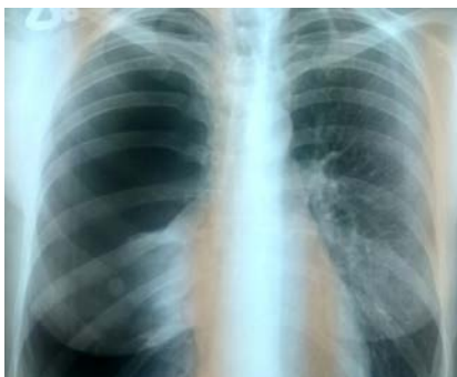
Fig. 1 – Chest radiography showing a complete right pneumothorax.

In January 2018, a 42-year-old woman presented with sudden cough and shortness of breath on the first day of menstrual cycle. A chest radiography revealed a complete right pneumothorax (Figure 1). The patient's history was positive for pelvic endometriosis [presenting