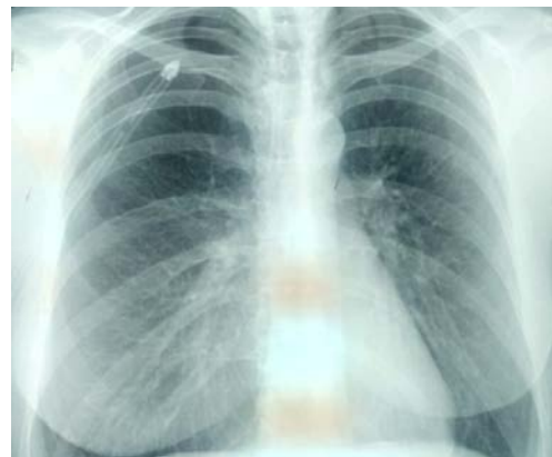
Fig. 2 – Chest radiography showing the resolution of pneumothorax after chest tube placement.

On admission, she was treated primarily with a chest tube (Figure 2), followed by video-assisted thoracoscopic surgery (VATS) to explore the right hemithorax. The apex of the right lung showed bullous lesions (Figure 3), and an area of fenestration was noticed in the right tendinous portion of the diaphragm (Figure 4). An atypical resection of the pulmonary apex was performed with an endostapler. Also, diaphragm plication was performed with Ethibond sutures. The lung tissue was examined histologically ex tempore , with several tissue fragments showing the structure suggestive of endometriosis on hematoxylin and eosin stain. However, the definitive histopathological examination of the resected tissue showed bullous changes without definitive signs of endometriosis (lack of endometrial glands or stroma, as well as the negative immunohistochemical test for estrogen receptors). A postoperative course of GnRH agonist triptorelin was administered during the period of 6 months. The patient's postoperative recovery was uneventful, without a recurrence of pneumothorax to this day.