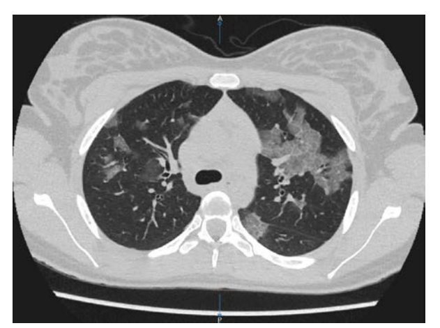
Fig. 4 – Axial thin-section unenhanced computed tomography (CT) shows bilateral crazy paving pattern with vascular enlargement in the upper and lower left lobe and in the upper right lobe with central and peripheral distribution .

Kosanović T, et al. Vojnosanit Pregl 2021; 78(6): 642-650.