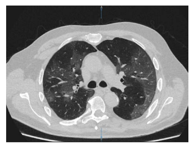
Fig. 3 – Axial thin-section unenhanced computed tomography (CT) scan shows bilateral ground-glass opacities (GGO) with reticulation, bronchiectasis and bronchovascular thickening with central and peripheral distribution.

Results are expressed as number (%) or median (IQR- interquartile range: 25–75th percentile); <sup>1</sup>Cumulative percentage; *Mann-Whitney test; #Kruskal-Wallis test.