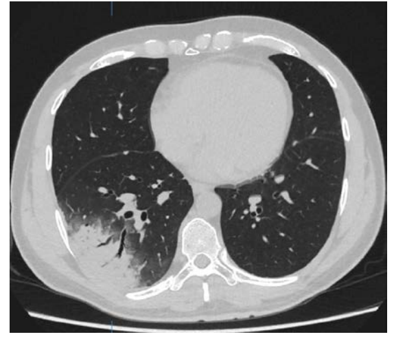
Fig. 5 – Axial thin-section unenhanced computed tomography (CT) scan shows right unilateral consolidation with air bronchogram with peripheral distribution in the right lower lobe.