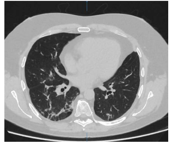
Fig. 6 – Axial thin-section unenhanced computed tomography (CT) scan shows left pleural thickening with bilateral subpleural lines and fibrous stripes in the posterior segments of the lower lobes.

Fig. 5 – Axial thin-section unenhanced computed tomography (CT) scan shows right unilateral consolidation with air bronchogram with peripheral distribution in the right lower lobe.