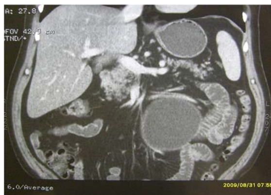
Fig. 1 – Cystic round formation in the close contact with jejunal loops on the frontal sections of multislice computed tomography abdominal scan.

blood count and clinical biochemistry tests were within normal range, with exception of cholesterol and triglycerides which were elevated. The patient started receiving antihypertensive therapy followed by normalization of BP. Repeated US confirmed tumor formation, which was seen as a hypoechoic cyst approximately 15 \times 12 cm in diameter, with a hyperechoic wall and posterior amplification. MSCT scan showed a hypodense circular formation with hypoechoic content, which was in direct contact with the jejunal loops, unevenly thin with partially calcified wall, without a change in postcontrast attenuation. In the peritoneum and retroperitoneum no enlarged lymph nodes were found nor the presence of free intraperitoneal fluid (Figure 1). Irrigography excluded the possibility of infiltration of the colon, external compression of the caudal part of the transverse colon was seen, without lumen narrowing. The patient had no previous surgery. The patient stated a traffic accident two years ago, in which he received a blunt impact in the abdomen, without any significant consequences.