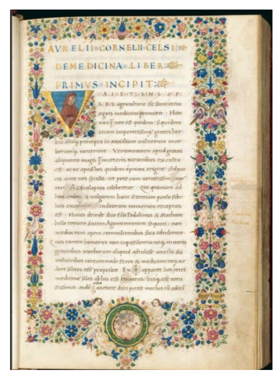
Fig. 3 – De medicina, Celsus. Available from: https://www.historyofinformation.com/detail.php?id=1765 19.

Aulus Cornelius Celsus was a Roman physician who lived between 25 BC and 50 AD. He wrote a collection of eight books, De Medicina (Figure 3) <sup>19</sup>.