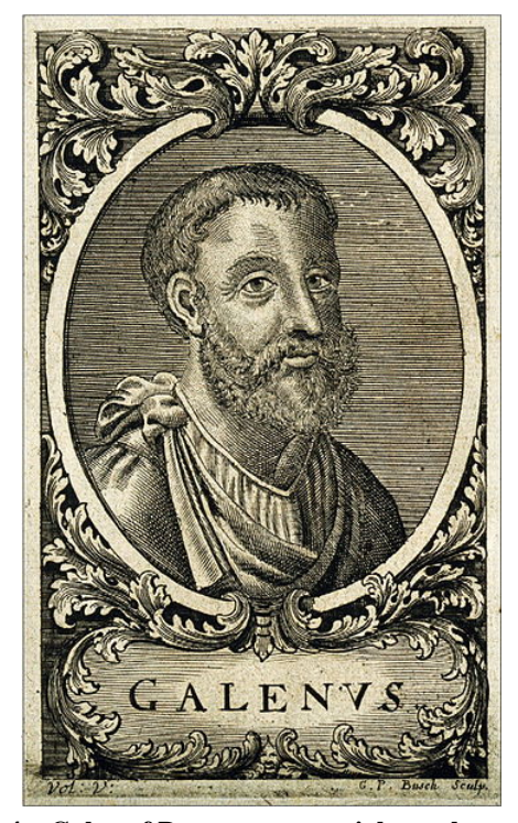
Fig. 4 – Galen of Pergamum: an eighteenth-century portrait by George Paul Bush.

Galen was born in Pergamon, today's Bergama in Turkey. The exact year of birth and death are unknown but it is believed that he was born in 129 and died around 215 AD <sup>18</sup> (Figure 4).