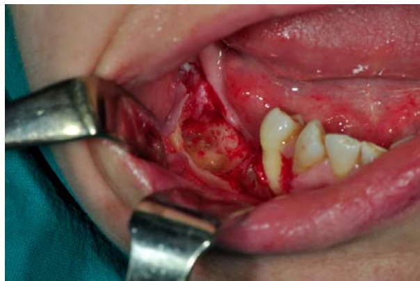
Fig. 2 – Intraoral view of the coronectomied teeth.

postoperatively did not show any movement of the roots left in the mandible; the molar roots were fully covered by bone and premolar roots only partially (Figure 4).