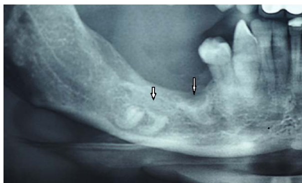
Fig. 4 – Panoramic view of the right mandible and the coronectomied teeth two years after the operation.