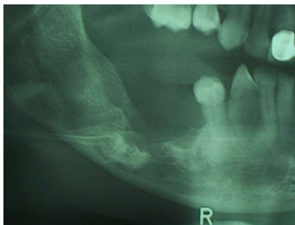
Fig. 3 – Panoramic view of the right mandible and the coronectomied teeth six months after the operation.