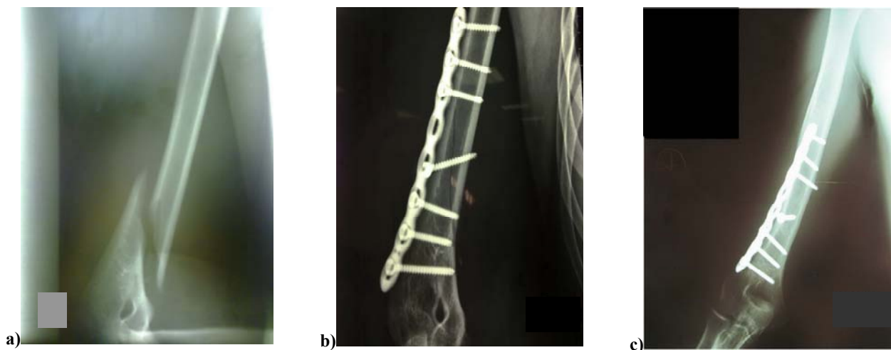
Fig. 1 – Patient A: a) preoperative radiography done at the Emergency Room Department on the day of injury; b) and c) postoperative radiography.