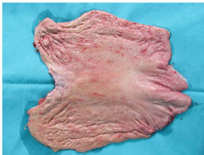
Fig. 3 – Specimen after total gastrectomy – the stomach open along the greater curvature. Macroscopic appearance of hypertensive gastropathy.