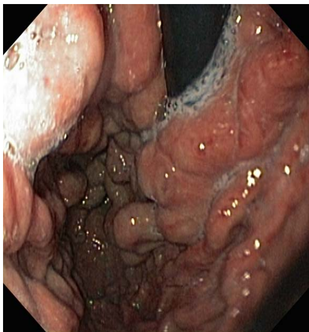
Fig. 1 – Macroscopic appearance of gastric varices and hypertensive gastropathy

Thrombosis of portal, lienal and mesenteric veins was diagnosed using MSCT angiography. After repeated EGD it was