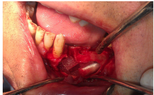
Fig. 3 – Intraoral reconstruction of the mandibular defect with heterogeneous bone blocks.

First, we removed gangrenous roots of the left lower premolar teeth. Surgical procedure started with incision along the superior border of the left mandible body, between the left mandibular canine and the second mandibular molar, then around the gingival margin of the left second mandibular incisor, mandibular canine and second mandibular molar, with two relaxing incisions down to the fornix. After uplifting the mucoperiosteal flap, a cortical perforation of the buccal cortex of the mandible body could be seen, as well as the membrane of the radicular cyst. After careful separation of the cystic membrane from surrounding anatomical structures and the mental nerve, lateral transposition of mental nerve was done. Then, the cyst was completely enucleated and the defect rinsed with saline (Figure 2). The filling completely blocked the defect with bone blocks (Osteovit ® , B. Braun Melsungen AG, Germany) (Figure 3), and the wound was primarily closed with 4–0 silk sutures.