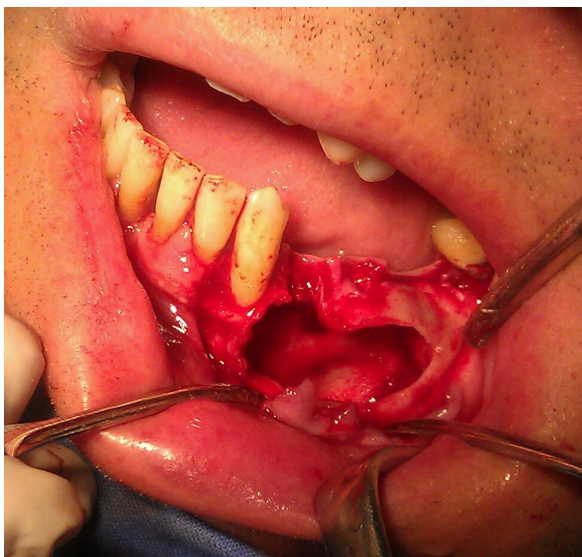
Fig. 2 – Bone defect after complete enucleation of the cystic lesion.

Due to the existing infection at the time of examination, we made intraoral incision for drainage and commenced with antibiotic therapy (amoxicillin/clavulanate and metronidazole, orally). Seven days later, the symptoms of infection subsided and the patient underwent an incisional biopsy of the lesion under local anesthesia (4% Articain hydrochloride TM , 3M ESPE). As the left mandibular canine was nonvital, endodontic treatment was performed. A few days later, a pathological finding confirmed the diagnosis of radicular cyst.