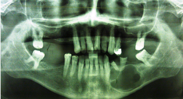
Fig. 1 – Orthopantomographic radiography at the time of examination showing large elliptical multilocular radiolucency located in the left side of the mandibular body.

de, because of expansion of the mandibular buccal cortex on the left side, as well as a large peri-mandibular soft tissue swelling. Intraoral examination revealed gangrenous roots of the left first and second mandibular premolars. On the panoramic radiography, a large elliptical multilocular radiolucency, located in the left side of the mandibular body, could be noticed (Figure 1).