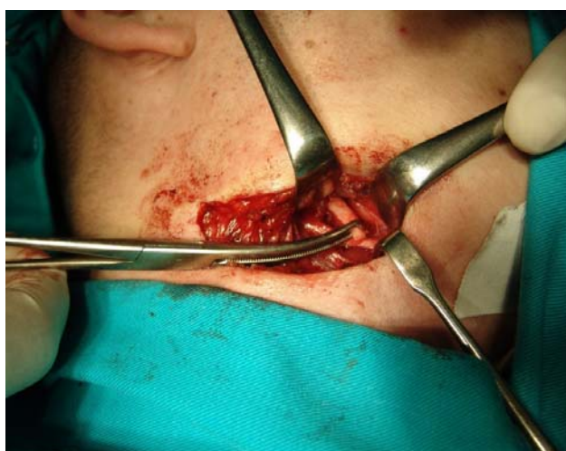
Fig. 5 – Extraoral approach to styloid process.