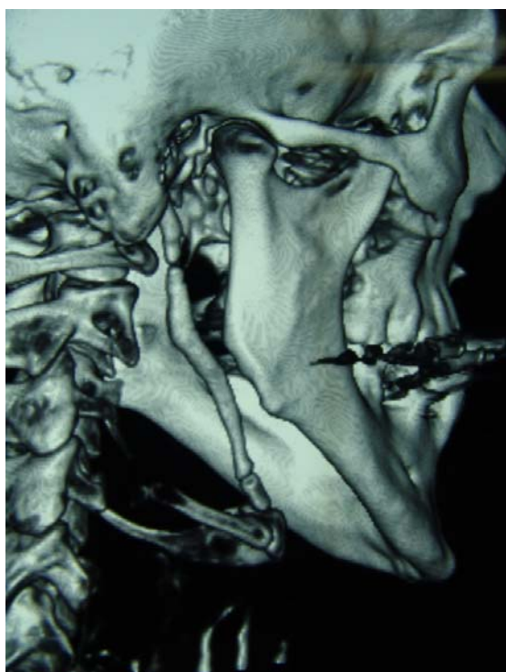
Fig. 4 – Computed tomography scan with 3D reconstruction in Eagle's syndrome.

of examination more on the right. The patient denied earlier surgical intervention. CT scan with 3D reconstruction revealed the elongated right styloid process (62 mm length, 5 mm wide, with slight angulation of 20° right stylohyoid ligament) while the length of the left styloid process was 49 mm and the width of about 4 mm (Figure 4). The treatment plan included right styloidectomy under general anesthesia, and because of the length of the process and involvement of stylohyoid ligament, it was decided to approach it extraorally (Figures 5 and 6). Antibiotic therapy was administered preoperatively. Surgery under general anesthesia and postoperative period passed regularly, and the patient was discharged on the third postoperative day. At regular postoperative examinations the patient was subjectively without complaints.