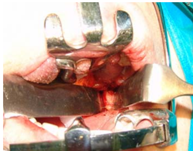
Fig. 2 – Intraoral approach to styloid process.

without involvement of the ligaments, and surgical treatment by intraoral approach was planned. Surgical treatment included entailed resection of elongated styloid process on the right side under general anesthesia. After the usual preoperative preparation unilateral right side styloidectomy by intraoral approach was made (Figure 2). Antibiotic therapy was prescribed. The postoperative period passed regularly, the wound healed without any signs of infection. The patient was discharged on the third postoperative day. Regular postoperative control showed no complaints.