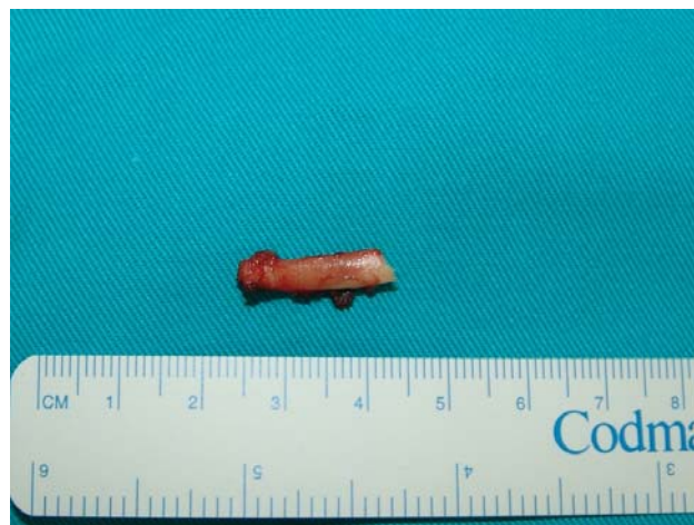
Fig. 6 – The resected styloid process.