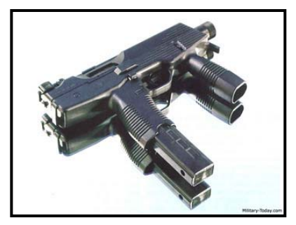
Figure 7 – Steyr TMP Submachine gun Puc. 7 – Автомат Steyr ТМП Слика 7 – Аутомат Steyr TMP

The original Steyr AUG submachine gun, shown in Figure 8, is a modified and improved design of the original Steyr AUG assault rifle. It is designed for close combat in police and military actions. This weapon combines relatively compact dimensions with good precision, thanks to a long barrel and a closed bolt. If necessary, the Steyr AUG can be fitted with a silencer. Some basic components are taken from the Steyr AUG assault rifle, such as the polymer stock, while the principle of operation is different. What was kept is the hammer-firing mechanism with a special progressive trigger (pulling the trigger halfway produces a single shot while pulling it until the end produces burst fire). Also, the magazine housing has a special magazine adapter. (Mihajlović & Arsić, 2003)