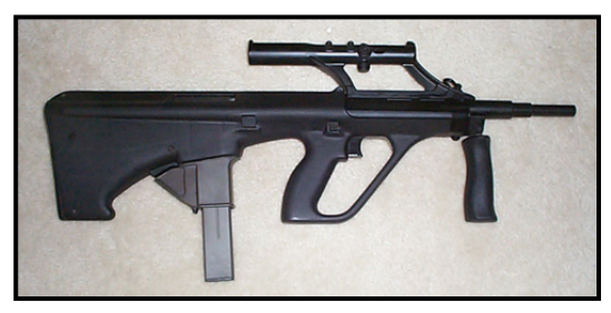
Figure 8 – Steyr AUG Submachine gun Puc. 8 – Автомат Steyr АУГ Слика 8 – Аутомат Steyr AUG

The Brugger & Thomet MP9 submachine gun, Figure 9, is a modified version of the Steyr TMP. Swiss weapons designers made a total of 19 changes to the TMP. The MP9 submachine gun is currently used in Switzerland, India and Portugal. This submachine gun is smaller than the H&K MP5, which makes it ideal for special units and law inforcement forces. Its compact size has, however, led to the reduced range of effective fire. The MP9 is designed so that it has an integrated front handle, so it can be easily controlled during automatic fire. This submachine gun can be fired single-handedly. The main novelty of the MP9 compared to the TMP is a side-folding stock and a Picatinny-type scope rail which can accept a wide variety of optical sights. The MP9 submachine gun also has a mechanical sight and is compatible with silencers.