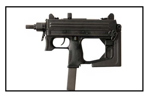
Figure 12 – Ruger MP9 Submachine gun Puc. 12 – Автомат Ruger MP9 Слика 12 – Аутомат Ruger MP9

The UZI submachine gun, Figure 13, was designed by Israeli designer, Uzziah Gal in 1949, then lieutenant of the just formed AF of the Republic of Israel. The weapon is named in his honor. It was officially adopted in 1951, but become operational in 1954 and was first given to the special units of the Israeli AF. Produced by the IMI company, the UZI was so successful that it was adopted by more than 90 countries around the world, either for the army or the police forces, but it is also a favorite weapon of terrorists around the world. Over the decades, there have been a lot of "family members" (design versions) of this model. It was licensed and produced in Belgium (FN Uzi) and Rhodesia (Zimbabwe), while the most popular unlicensed variants were produced in China (Model 320) and Croatia (Model ERO). It works on the principle of free bolt recoil and uses an open bolt. The impact of the design of the Czechoslovak submachine gun model SaVz 23 is visible, especially in the magazine housed in the grip. The UZI is simple in design and technology, has relatively few moving parts and is primarily made of metal. The weapon was selected by the Israeli AF primarily due to its simplicity and ease of production. (http://military-today.com)