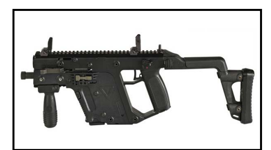
Figure 11 – Kriss Super V Submachine gun Puc. 11 – Автомат Kriss Super V Слика 11 – Аутомат Kriss Super V

The Ruger MP9 submachine gun, shown in Figure 12, is very similar to the Israeli IMI UZI. Designed as a compact weapon for law enforcement forces, this submachine gun was first introduced in early 1995. It was tested by the special units of the British AF - SAS. However, this weapon was produced in limited series. It works on the principle of free bolt recoil and fires from a closed bolt. Some parts of the weapon are made of polymer, primarily to reduce weight. The magazine housing is located in the grip and has a capacity of 32 rounds (the UZI has the same magazines). The Ruger MP9 has a redesigned folding stock. It can be cocked using either hand since the cocking handle is located on top of the weapon. The weapon does not have a Picatinny rail, and uses only mechanical sights.