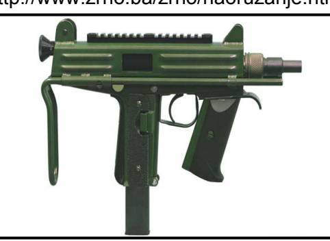
Figure 14 – CBJ MS Submachine gun Puc. 14 – Автомат CBJ MS Слика 14 – Аутомат CBJ MS

The H&K UMP submachine gun, Figure 15, was developed as a lighter and cheaper successor to the MP5. Its production started in 1999. The working principle is free bolt recoil with a closed bolt. The submachine gun has an effective range of fire of up to 100 m. The H&K UMP has a folding stock that folds to the right. It uses mechanical sights