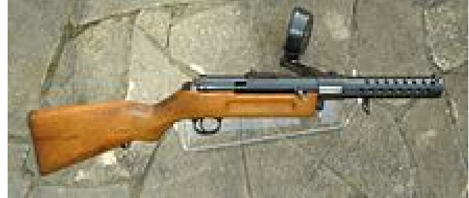
Figure 1 – Bergman MP 18/1 Рис. 1 – Бергман МП 18/1 Слика 1 – Bergman MP 18/1

Between late 1916 and 1918, about 30,000 copies of this submachine gun were produced and it was often copied in other countries. The MP18/1 had several drawbacks, the main one being the use of an unreliable small drum from a Luger pistol which was soon replaced by a simpler box-magazine of the capacity of 32 rounds. The term "submachine" originated from the use of a smaller caliber round than that of a rifle round, i.e. a specific type of a pistol round, and the fact that it was able to achieve full automatic fire. Although it proved to be a very effective weapon, the MP18/1 manufacture did not continue after the First World War because Germany empire was defeated and its arms production was banned by the Versailles Peace Treaty.