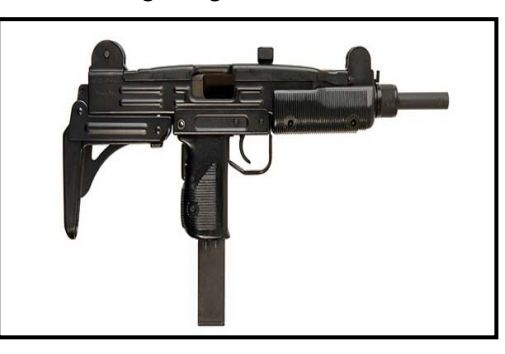
Figure 13 – UZI Submachine gun Puc. 13 – Автомат UZI Слика 13 – Аутомат UZI

The CBJ MS submachine gun, Figure 14, was designed by Swedish designer of weapons Bert Johnson who founded a private company for production of weapons, CNJ Tech AB. This submachine gun, i.e. its different design solutions, was presented in the period from 2000 to 2003. This compact weapon is intended for commanders, drivers, tank and artillery crews, pilots and medical staff. The CBJ MS submachine gun works on the gas principle. It fires from a closed bolt. The weapon is actually a modified version of the Israeli UZI. It uses the 6.5x25 mm ammunition which, during experiments, showed better performance than the 5.56 and 7.62 mm NATO ammunition. The primary ammunition type of this SMG is an armour-piercing round with greater penetration performance. During trials, the CBJ MS round penetrated the standard Crisat armor at a distance of 230 m. Some weapon designers claim that the CBJ MS is superior to the Belgian FN P90 and the HK MP7. This submachine gun is ideal for close combat and self-defense while being