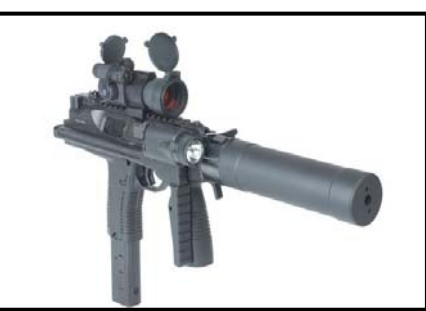
Figure 9 – Brugger & Thomet MP9 Submachine gun Puc. 9 – Автомат Brugger & Thomet MP9 Слика 9 – Аутомат Brugger & Thomet MP9

effective firing range: from 50 to 100 m. (Mihajlović & Arsić, 2003)