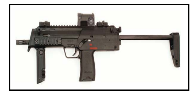
Figure 16 – H&K MP7 Submachine gun Puc. 16 – Автомат X&K MP7 Слика 16 – Аутомат H&K MP7