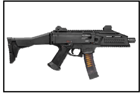
Figure 10 – Scorpion EVO III Submachine gun Puc. 10 – Автомат Scorpion EBO 3 Слика 10 – Аутомат Scorpion EVO III

effective firing range: to 200 m. (http://world.guns.ru/smge.html)