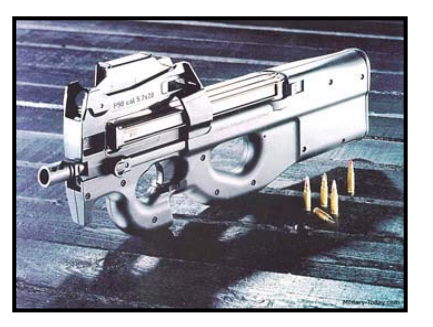
Figure 5 – FN P90 Submachine gun Puc. 5 – Автомат ФН П90 Слика 5 – Аутомат FN P90