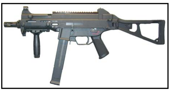
Figure 15 – H&K UMP Submachine gun Puc. 15 – Автомат H&K UMP Слика 15 – Аутомат H&K UMP

or various optical sights on a Weaver-type rail mounted on top. There are three variants of the UMP: UMP45, using .45 ACP (11.43x23 mm), then UMP40 with .40 S&W (10x22 mm Smith & Wesson), and UMP9 which uses the 9x19 mm Parabellum. In addition to a variety of ammunition, all versions have the same design, while the most striking difference is a curled magazine of the UMP9. All three versions can use any ammunition type providing the bolt, the barrel and the magazine are changed. Table 1 gives a review of the tactical and technical characteristics of the H&K UMP submachine gun. (http://militarytoday.com)