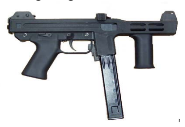
Figure 6 – Spectre M4 Submachine gun Puc. 6 – Автомат Spectre M4 Слика 6 – Аутомат Spectre M4

The Steyr TMP submachine gun, shown in Figure 7, was designed in the famous Austrian military company Steyr-Mannlicher in the early nineties of the 20th century. Its production officially began in 1992 and terminated in 2001 primarily due to poor sales. The license for the production was transferred to a Swiss company and one of the design solutions is still produced. The Steyr TMP submachine gun enables slower, but more controlled fire. It has been found that it is very stable during automatic fire. The shooter fires a burst of 10 to 15 rounds while other submachine guns are limited to a burst of 2 to 3 rounds. Many parts