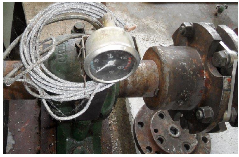
Figure 2 – Damage to the flange of flexible elastic couplings on the flywheel shaft of a mini hydro power plant

Рис. 2 – Изображение повреждений фланца упругой муфты на оси маховика мини-ГЭС Слика 2 – Приказ оштећења прирубнице еластичне спојницие на осовини замајца мини-хидроелектране