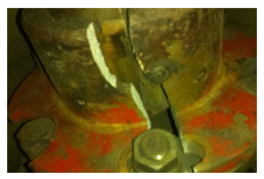
Figure 3 – Broken flange of the elastic coupling on the mini hydro generator flywheel Puc. 3 – Изображение сломанного фланца упругой муфты на оси генератора мини-ГЭС Слика 3 – Приказ поломљене прирубнице еластичне спојнице на осовини генератора мини-хидролектране

Рис. 2 – Изображение повреждений фланца упругой муфты на оси маховика мини-ГЭС Слика 2 – Приказ оштећења прирубнице еластичне спојницие на осовини замајца мини-хидроелектране