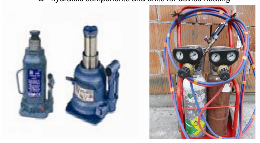
Figure 1 – Device for dismantling and assembling not-easily detachable mechanical and electrical assemblies