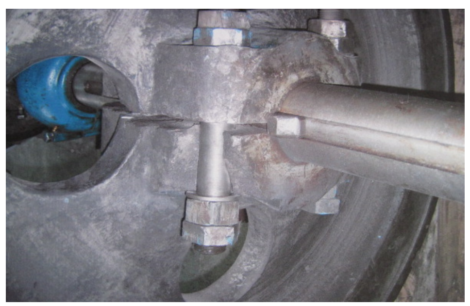
Figure 4 – Damaged flywheel of a mini hydro power plant Puc. 4 – Изображение повреждений маховика мини-ГЭС Слика 4 – Приказ оштећења замајца мини-хидроелектране

Figure 4 presents a mini hydro power plant flywheel damaged due to inadequate removal. The lower wedge for a clamping screw on the underside of the flywheel (left side of Figure 4) was broken. The "naked" screw that has no tightening function can be seen. Huge damage was inflicted. Creating a new flywheel is very complex, expensive and time-consuming with a foreign manufacturer. Installing a new flywheel on a mini hydro power plant requires dynamic balancing and vibration measurements.