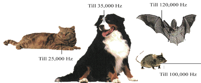
Figure 1 – Range of audibility in animals http://www.znanje.org/i/i25/05iv08/05iv080911fl/zvuk.htm , 2016) Рус. 1 – Диапазон слышимости животных http://www.znanje.org/i/i25/05iv08/05iv080911fl/zvuk.htm , 2016) Слика 1– Спектар чујности код животиња http://www.znanje.org/i/i25/05iv08/05iv080911fl/zvuk.htm , 2016)

the medium through which sound travels. Frequency is the number of oscillations produced in one second and is measured in the unit called Hertz (Hz). A normal human ear can hear frequencies in the range from 20 to 20 000Hz. Every sound below a frequency of 20 Hz is called infrasound and every sound under 20 000 Hz is called ultrasound; they have wide application in medicine and technology. Certain animals (such as dogs, cats, bats, etc.) have a much wider spectrum of hearing sounds (Figure 1).