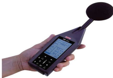
Figure 2 – Phonometer ( http://www.3me.rs/portfolio-item/db-200-profesionalni-merac-nivoa-buke-sa-pc-interfejsom , 2016)

Nowadays, there are a number of standard methods for measuring the physical parameters of noise which are relatively simple for use; their purpose is to assess the level of damage in accordance with the rules and norms for certain conditions. The basic instrument for noise level determination is a phonometer (soundmeter, measurer of the noise level) (Bruel & Kjaer, 1984, pp.10-15). It is presented at Figure 2.