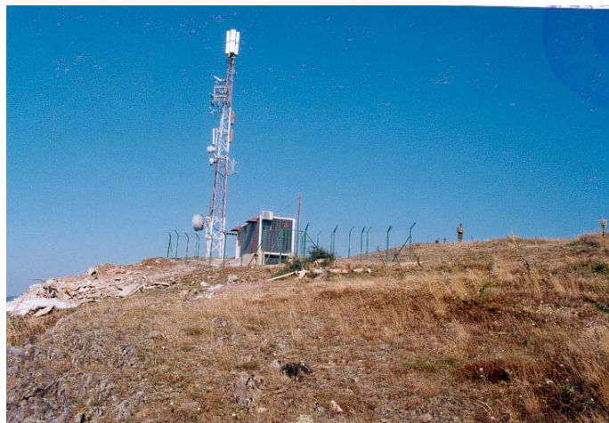
Figure 3 – Location 1 "Pljačkovica" Рисунок 3 – Локација 1 «Пљачковица» Слика 3 – Локација 1 – „Пљачковица”