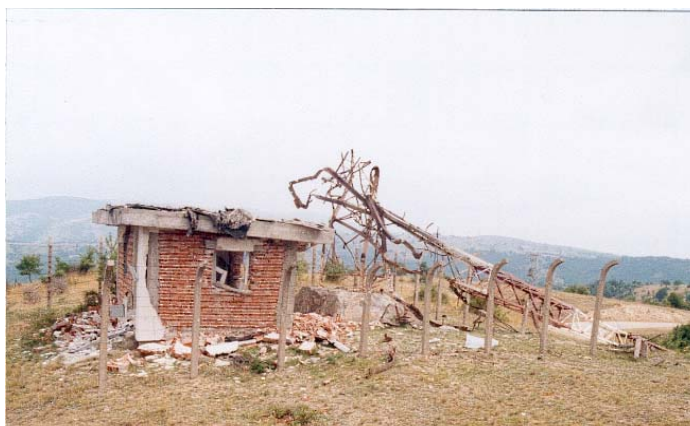
Figure 6 – Location 4 "Reljan" Рисунок 6 – Локација 4 «Релян» Слика 6 – Локација – 4 „Релџан”

The radiological reconnaissance was performed in accordance with the then valid rules and instructions of the ABHO units, and after the experiences gained on that occasion, the appropriate tactical actions of the ABHO units were changed and a new Instruction was issued.