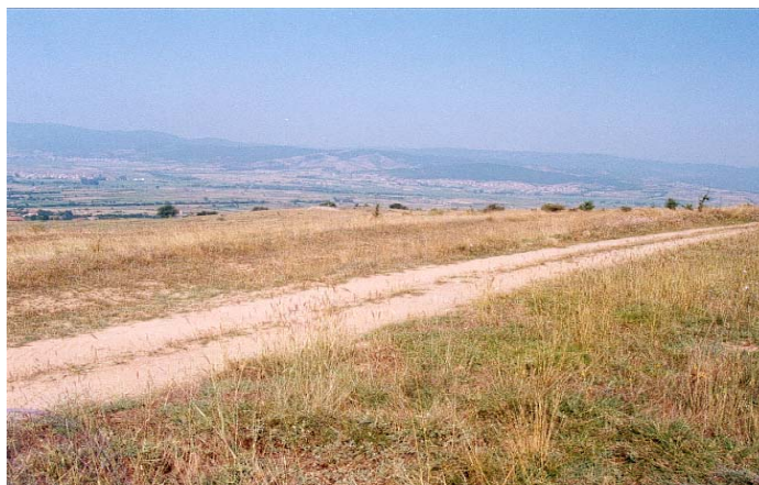
Figure 5 – Location 3 "Bratoselce" Рисунок 5 – Локација 3 «Братоселце» Слика 5 – Локација 3 – „Братоселце”