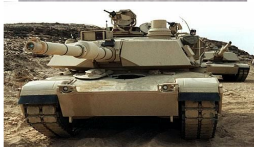
Figure 1 – Means for the application of DUA: A-10 Thunderbolt II aircraft and tank Abrams M1A2