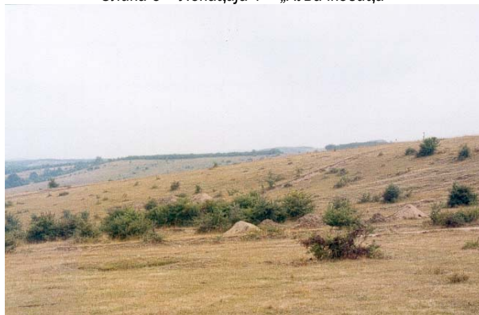
Figure 4 – Location 2 "Borovac" Рисунок 4 – Локација 2 «Боровац» Слика 4 – Локација 2 – „Боровац”