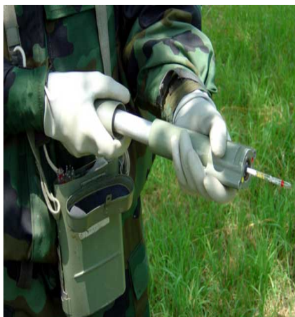
Figure 9 – Method of detection of toxic chemicals Рисунок 9 – Метод обнаружения токсичных химикатов Слика 9 – Начин детекције отровних хемијских супстанци

The scout for X reconnaissance controls the presence of TC with the help of SACD, and determines a possible presence and concentration of other toxic substances with a hand-held chemical detector (Figure 9).