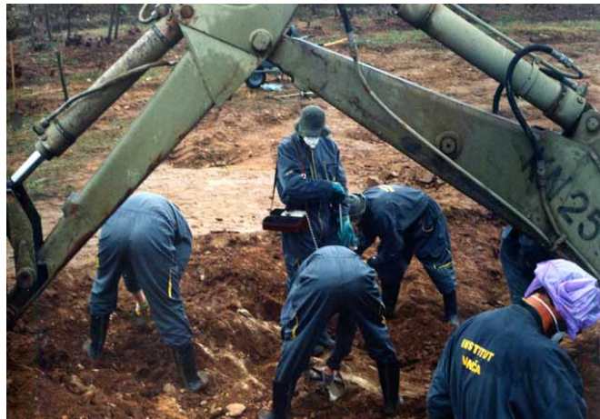
Figure 7 – Radiological reconnaissance of the place of DUA strike Рисунок 7 – Изображение радиологической разведки участка БОУ Слика 7 – Приказ радиолошког извиђања места дејства МОУ

the mean value is taken), Figures 7 and 8. (Serbian Armed Forces - General Staff, 2014, pp.48-50)