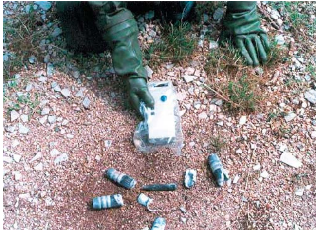
Figure 8 – Measurement of the radioactive contamination of DUA samples on the ground Рисунок 8 – Измерение радиоактивного загрязнения образцов БОУ на почве Слика 8 – Мерење радиоактивне контаминације узорака МОУ на земљишту

During R reconnaissance, special attention must be paid to the altitude and the location where the measurements are performed,