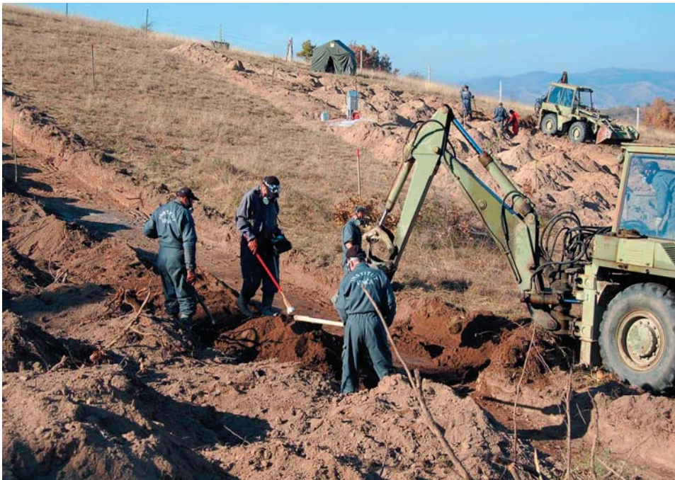
Figure 10 – Soil decontamination using engineering machines Рисунок 10 – Обеззараживание почвы инженерными машинами Слика 10 – Деконтаминација земљишта употребом инжињеријских машина

For more efficient work on the decontamination of DUA contaminated areas, the members of engineering units also participated with engineering machines in field preparation (construction of access communications) and R decontamination (removal of the upper layer of contaminated soil), Figure 10.