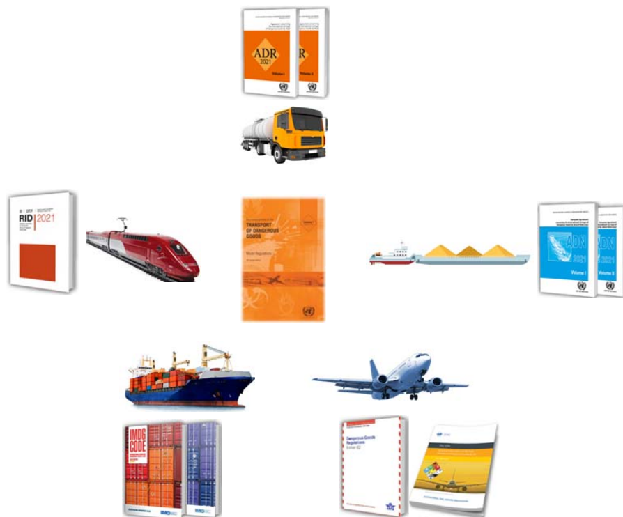
Figure 4 – International agreements on transport of dangerous goods Рис. 4 – Международные соглашения по перевозке опасных грузов Слика 4 – Међународни споразуми о транспорту опасне робе