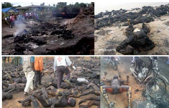
Figure 3 – Consequences of the accident in Okobie–Nigeria, 12 th July 2012.

– On 12 th July 2012, in Okobie town in Nigeria, there was an explosion of a road tanker for gas transport (Figure 3). One hundred and twenty one people were killed in the accident and 75 were injured.