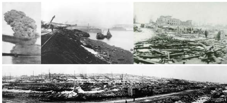
Figure 1 – Disaster in Halifax in 1917, the explosion of the ship and the consequences (Janković, 2016)

– On 6 th December 1917, in Halifax (Nova Scotia), Figure 1, there was a collision due to the accident of the French ship "Mont Blanc" and the Norwegian ship "SS imo", in the access port and channel - Halifax, at a low speed of about 2.5 km/h. The Mont Blanc ship was carrying about 3.2 million pounds of picric acid and TNT for the needs of the French army in World War I. The effect of the explosion was in fragments of the ship, a shock wave and a tsunami 18 meters high, created by the explosion. The estimated temperature of the explosion was about 5000 ° C. A pyrotrophic cloud rose to an altitude of about 3600m. The number of victims has never been precisely determined. It is believed that about 1,600 people were killed immediately, and about 400 succumbed to injuries, 9,000 were injured, 1,600 homes were destroyed in a series of fires and 12,000 homes were damaged. The industrial sector of the city was completely destroyed. The Halifax disaster was the unofficial start of systematic consideration of hazardous substances (Janković, 2016).