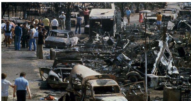
Figure 2 – Consequences of an accident on the way to Los Alfaques in 1978.

– In 1978, in Los Alfaques (Spain), a fuel tank was overloaded. Due to high heat and pressure, the tank exploded and the fuel caught fire, killing 216 people (Figure 2).