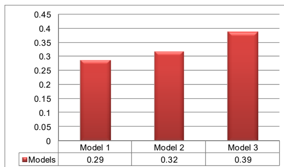
Figure 7 – Graphic representation of the final decision Рис. 7 – Графическое изображение окончательного решения Слика 7 – Графички приказ коначне одлуке

Figure 7 holds the results of the final decision.