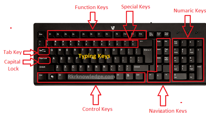
Figure 1 – Keyboard keys (Chauhan, 2020) Рис. 1 – Клавиши (Chauhan, 2020) Слика 1 – Тастера (Chauhan, 2020)

Figure 2 shows physical division and a reference grid defined by ISO/IEC 9995 standard series. The sections are further subdivided into zones as follows: