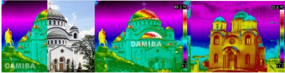
Figure 2 – Thermal images of the Saint Sava's Temple in Belgrade and a Boleč Church (suburb of Belgrade)