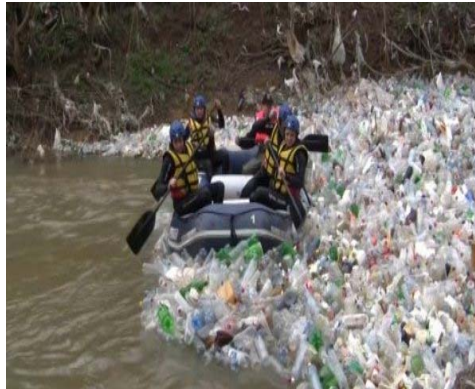
Figure 3 – Human carelessness and neglect of nature ( http://studiob.rs , 2015)

Everyday life and powers of the nature point to the necessity to implement logistics prevention ( http://studiob.rs , 2015): "Frequent floods on the left Danube river bank are a consequence of uncleaned canals (Figure 3). In order to prevent this, their cleaning has began ( http://studiob.rs , 2015)."