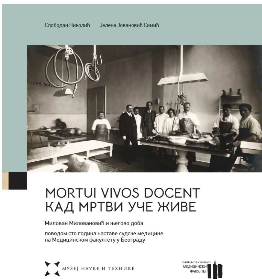
Slika 1. Naslovna korica kataloga izložbe „ Mortui vivos docent – Kad mrtvi uče žive : Milovan Milovanović i njegovo doba“