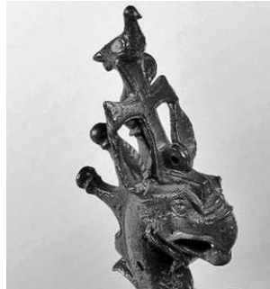
FIG. 6 DETAIL OF THE LAMP WITH HANDLE IN THE SHAPE OF A GRIFFIN'S HEAD, NATIONAL MUSEUM BELGRADE. PHOTO IN PUBLIC USE; Сл. 3 ЛАМПА СА ДРШКОМ У ОБЛИКУ ГЛАВЕ ГРИФОНА, ДЕТАЉ, НАРОДНИ МУЗЕЈ, БЕОГРАД. ФОТОГРАФИЈА У ЈАВНОЈ УПОТРЕБИ.

century, being depicted in monumental art, but likewise on personal and utility items (Baert 2004, pp. 17–21).