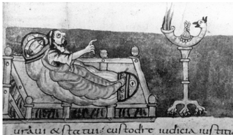
FIG. 2 DEPICTION OF GRIFFIN LAMP FROM STUTTGART PSALTER . STUTT. BILDERPS. I , F. 139R QUOTED IN ΧΑΝΘΟΡΟΥΛΟΥ, 2010, P. 16; Сл. 2 ЛАМПА СА ГРИФОНОМ ИЗ ШТУТГАРСКОГ ПСАЛТИРА. STUTT. BILDERPS. I , F. 139R ПРЕМА ΧΑΝΘΟΡΟΥΛΟΥ, 2010, P. 16.

The lamp from the National Museum has the dimensions 21 × 6.5 × 16 cm, which, judging from the analogies, was a standard size. It is characterised by a round body, depicted with the fleur-de-lys motif on both ends. In the middle of the body, on both sides, there is the Christ's monogram, or staurogram. The pouring hole is also placed in the middle of the body and once had a lid, which is now lost. On