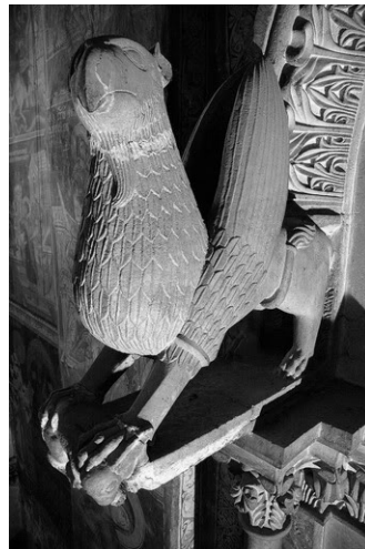
FIG. 7 GRIFFIN FROM THE NAVE PORTAL OF THE CHURCH OF CHRIST PANTOCRATOR, DEČANI MONASTERY, XIV CENTURY. PHOTO IN PUBLIC USE; Сл. 7 Грифон са унутрашњег портала цркве Христа Пантократора, манастир Дечани, XIV век. ФОТОГРАФИЈА У ЈАВНОЈ УПОТРЕБИ.

The association between the motifs of the cross and the griffin, or more precisely, the triumph of the first over the latter symbol has a basis in early Christian writings. The contest between Christ