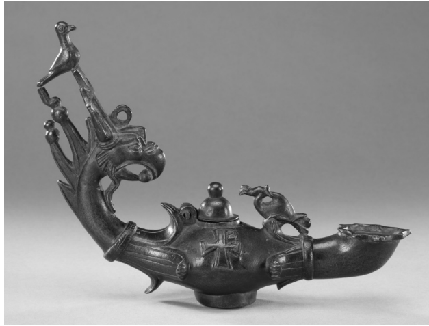
FIG. 1 LAMP WITH HANDLE IN THE SHAPE OF A GRIFFIN'S HEAD, VMFA. PHOTO CREDITS: ARTHUR AND MARGARET GLASGOW FUND, VIRGINIA MUSEUM OF FINE ARTS IN RICHMOND, VIRGINIA; Сл. 1 ЛАМПА СА ДРШКОМ У ОБЛИКУ ГЛАВЕ ГРИФОНА, VMFA. PHOTO: ARTHUR AND MARGARET GLASGOW FUND, VIRGINIA MUSEUM OF FINE ARTS IN RICHMOND, VIRGINIA