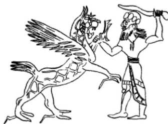
FIG. 5 DRAWING OF THE LION-GRIFFIN, MIDDLE ASSYRIAN FROM GOLDMAN, 1960, PL. 89/8; Сл. 5 Грифон - лав, СРЕДЊОАСИРСКИ ПЕРИОД, ПРЕМА GOLDMAN, 1960, PL. 89/8.

often appearing in funeral art (Goldman, 1960, pp. 320, 327; Srejo- vić, Cermanović-Kuzmanović, 1992, p. 99).