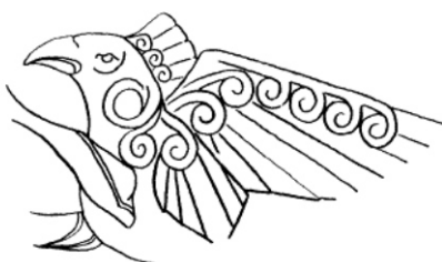
FIG. 5A DRAWING OF THE EAGLE-GRIFFIN, MYCENAEAN FROM GOLDMAN, 1960, PL. 89/5; Сл. 5 Грифон - орао, МИКЕНСКИ ПЕРИОД, ПРЕМА GOLDMAN, 1960, PL. 89/5.

In early Christian lamps, the griffin appears as a mythical being of great strength, closely related to the light and solar principles, being a sign of divine protection. By means of connecting pagan and Christian symbolism in the syncretism of Late Antiquity, the apotropaic and spiritual power of the griffin representation were being intensified. Nevertheless, the griffin with its flame-throwing eyes, reflecting Apollo's sacred principle, was still strongly connected with the pagan solar deity whom it symbolised. Apollo, the god of light, but also of intellectual enlightenment, who, assisted by the Muses, inspires poets, artists and thinkers, was perceived as a threat to Christ's authority (Jovanović, 2006, p. 13; Srejo- vić, Cermanović-Kuzmanović, 1992, pp. 275–276). 6 By placing the griffin, the symbol of pagan solar deity, on the lamp, it was directly