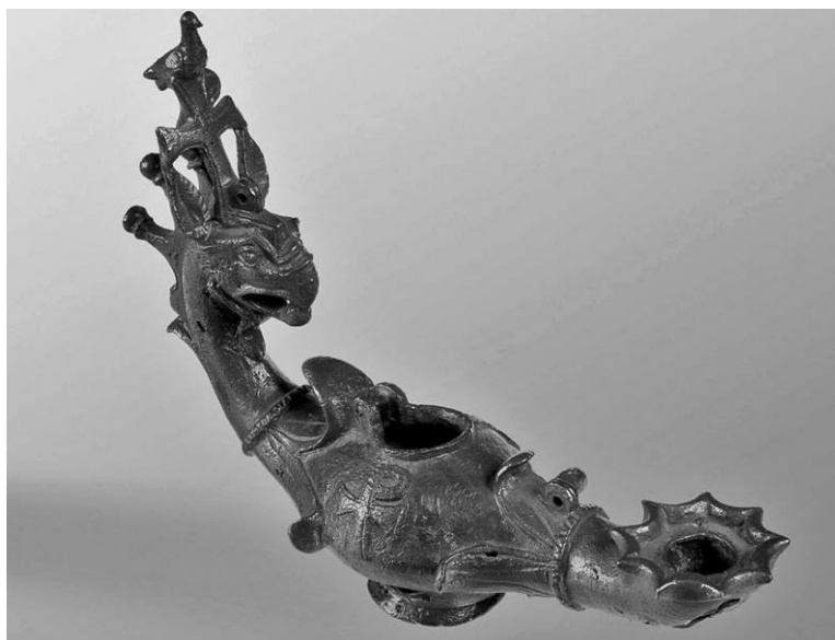
FIG. 3 LAMP WITH HANDLE IN THE SHAPE OF A GRIFFIN'S HEAD, NATIONAL MUSEUM BELGRADE. PHOTO IN PUBLIC USE; Сл. 3 Лампа са дршком у облику главе грифона, Народни музеј, Београд. Фотографија у јавној употреби.

all lamps containing a lid, it is of dome-like shape with a bead at the top (Xanthopoulou, 2010, pp. 163–167). Going towards the lamp's handle and nozzle, there is a plastic ring embellished with transverse incisions. An elongated nozzle finishes in the form of a flower composed of nine petals, in whose centre is the opening for the wick. The handle is modelled in the shape of griffin's head. The mane is shown in the form of three triangular neck protrusions finishing in balls. The griffin's head is neatly modelled, with a bent beak containing a ball, while the ears are pointed. At the top of the head there is a staurogram, surmounted with the depiction of a dove. The lamp's foot is small and in the shape of a ring, whereas a petite ring intended for fastening the lamp is preserved on the griffin's head and body.