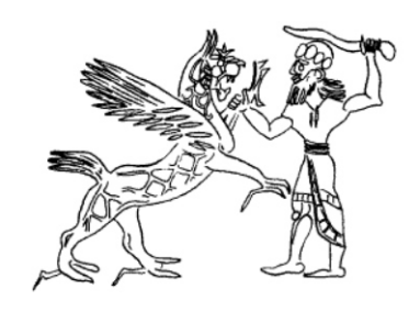
Fig. 5 Drawing of the Lion-Griffin, Middle Assyrian from Goldman, 1960, pl. 89/8; Сл. 5 Грифон - лав, средњоасирски период, према Goldman, 1960, pl. 89/8.

often appearing in funeral art (Goldman, 1960, pp. 320, 327; Srejović, Cermanović-Kuzmanović, 1992, p. 99).