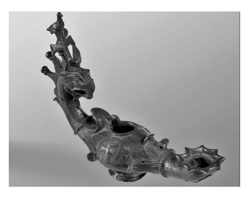
Fig. 3 Lamp with Handle in the shape of a Griffin's Head, National museum Belgrade. Photo in public use; Сл. 3 Лампа са дршком у облику главе грифона, Народни музеј, Београд. Фотографија у јавној употреби.

all lamps containing a lid, it is of dome-like shape with a bead at the top (Xanthopoulou, 2010, pp. 163–167). Going towards the lamp's handle and nozzle, there is a plastic ring embellished with transverse incisions. An elongated nozzle finishes in the form of a flower composed of nine petals, in whose centre is the opening for the wick. The handle is modelled in the shape of griffin's head. The mane is shown in the form of three triangular neck protrusions finishing in balls. The griffin's head is neatly modelled, with a bent beak containing a ball, while the ears are pointed. At the top of the head there is a staurogram, surmounted with the depiction of a dove. The lamp's foot is small and in the shape of a ring, whereas a petite ring intended for fastening the lamp is preserved on the griffin's head and body.