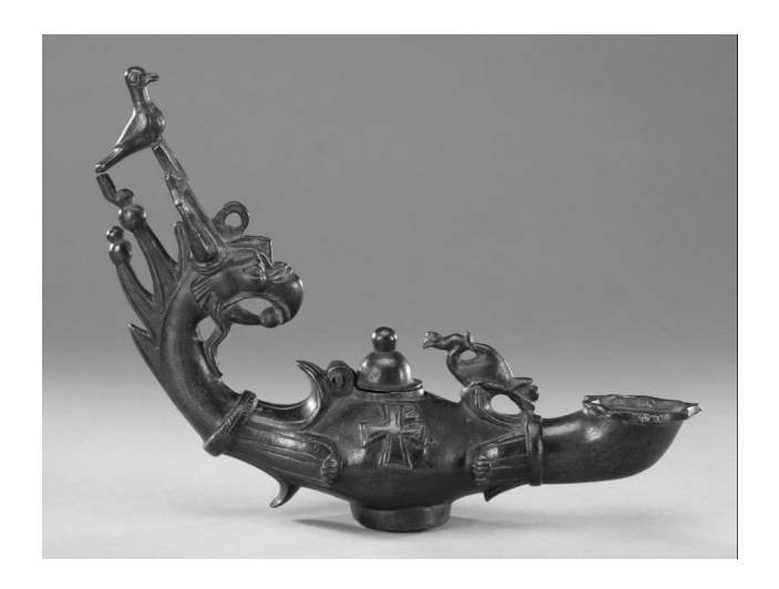
FIG. 1 LAMP WITH HANDLE IN THE SHAPE OF A GRIFFIN'S HEAD, VMFA. PHOTO CREDITS: ARTHUR AND MARGARET GLASGOW FUND, VIRGINIA MUSEUM OF FINE ARTS IN RICHMOND, VIRGINIA; Сл. 1 ЛАМПА СА ДРШКОМ У ОБЛИКУ ГЛАВЕ ГРИФОНА, VMFA. PHOTO: ARTHUR AND MARGARET GLASGOW FUND, VIRGINIA MUSEUM OF FINE ARTS IN RICHMOND, VIRGINIA