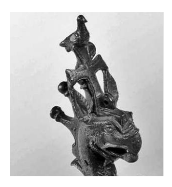
Fig. 6 Detail of the Lamp with Handle in the shape of a Griffin's Head, National museum Belgrade. Photo in public use; Сл. 3 Лампа са дршком у облику главе грифона, детаљ, Народни музеј, Београд. Фотографија у јавној употреби.

century, being depicted in monumental art, but likewise on personal and utility items (Baert 2004, pp. 17–21).