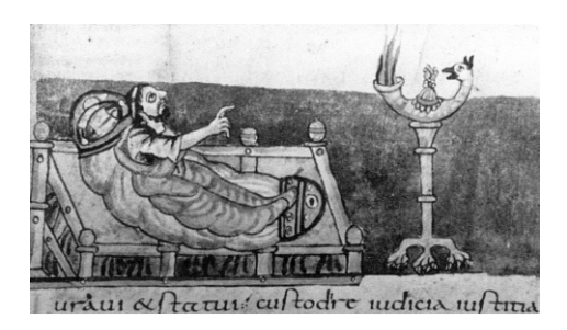
Fig. 2 Depiction of Griffin Lamp from Stuttgart Psalter . Stutt. Bilderps. I, f. 139r quoted in Xanthopoulou, 2010, p. 16; Сл. 2 Лампа са грифоном из Штутгарског псалтира. Stutt. Bilderps. I, f. 139r према Xanthopoulou, 2010, p. 16.

The lamp from the National Museum has the dimensions 21 \times 6.5 \times 16 cm, which, judging from the analogies, was a standard size. It is characterised by a round body, depicted with the fleur-de-lys motif on both ends. In the middle of the body, on both sides, there is the Christ's monogram, or staurogram. The pouring hole is also placed in the middle of the body and once had a lid, which is now lost. On