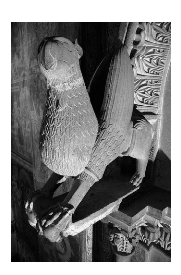
Fig. 7 Griffin from the Nave Portal of the Church of Christ Pantocrator, Dečani monastery, XIV century. Photo in public use; Сл. 7 Грифон са унутрашњег портала цркве Христа Пантократора, манастир Дечани, XIV век. Фотографија у Јавној употреби.

The association between the motifs of the cross and the griffin, or more precisely, the triumph of the first over the latter symbol has a basis in early Christian writings. The contest between Christ