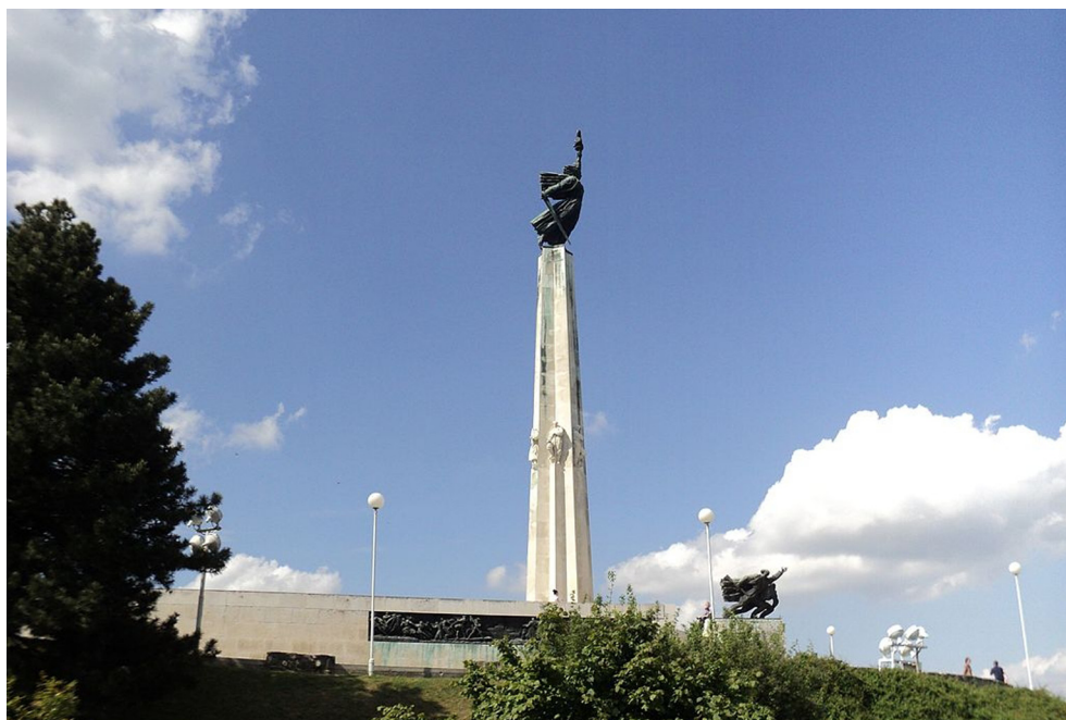
FIGURE 5: FIG. 5. ANTUN AVGUSTINČIĆ, THE MONUMENT OF GRATITUDE TO THE RED ARMY , BATINA, 1945-47.

On the occasion of fifteen years since renaming of the city into Tito's Užice, and, on the twentieth anniversary since the uprising in Serbia, on the main city Partisan square, the Monument of Marshal Tito was erected in 1962, the work of Frano Kršinić, who, as early as 1949, also created a sketch for the monument Marshal Tito on a Horse , intended for Zagreb but which was never realised (Baldani, 1977, p. 55).