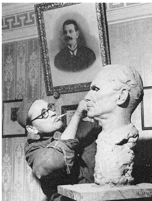
FIGURE 1: FIG. 1. JOHN PHILLIPS, ANTUN AVGUSTINČIĆ IS SCULPTING TITO'S BUST IN JAJCE BEFORE THE SECOND CONVENTION OF THE AVNOJ IN NOVEMBER 1943.

The new ideology treated the sculpture as a social weapon with which all that had come from the previous period should be denied and messages of the new "partisan art" whose purpose is to impose itself upon the broad masses of people as the moral and ideological foundation of the one-party system should be conveyed. The main work method insisted upon was based on a more realistic, more recognizable and clearer representation, and what was the most important, the message resulted from it must go to the right place and be understood by all layers of the masses of the whole Yugoslavia. As the most purposeful medium for this way of communication and for announcements of great themes from the PLW with no doubt were public monuments, which as political symbols in the space and time from the very beginning had the task to also memorise and represent the collective memory (Protić, 1982, p. 78).