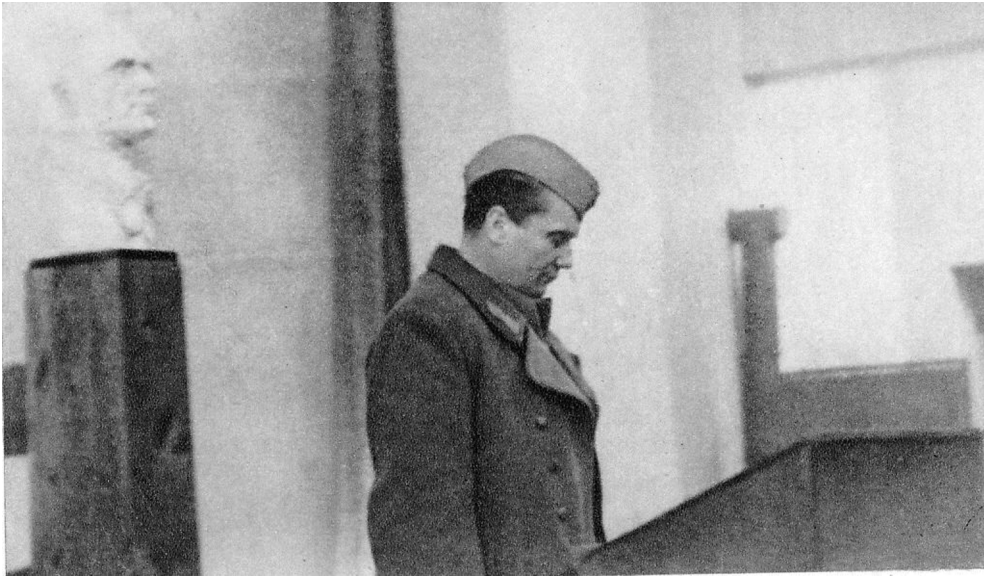
FIGURE 2: FIG. 2. THE SUPREME COMMANDER JOSIP BROZ TITO SUBMITTING THE REPORT ON THE DEVELOPMENT OF THE PEOPLE'S LIBERATION WAR AT THE SECOND SESSION OF THE AVNOJ IN JAJCE IN 1943. BEHIND HIM, TITO'S BUST, THE WORK OF AVGUSTINČIĆ CAN BE SEEN.

tion. This was about the figural compositions of the narrative form, where often in an allegorical way in stone or bronze, heroic fight and the suffering of the fighters were depicted, mass scenes or single figures in an action, where characters were heroized, and the events immediately recognizable.