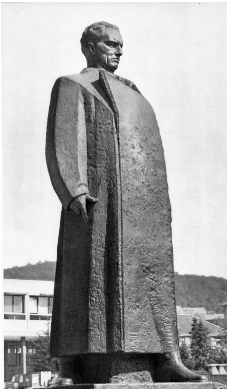
FIGURE 4: FIG. 4. FRANO KRŠINIĆ, THE MONUMENT OF MARSHAL TITO, TITO'S UŽICE, 1962.

In Užice, as the centre of the great liberated territory in Serbia by the end of 1941, the first partisan weapon factory was working, magazine Borba and the bulletin of the Supreme staff were printed, the first National Liberation Committee (Serb: Narodnooslobodilački odbor Srbije , hereinafter NOOS) was founded, and there was the Supreme Headquarters situated during the October and November. All this led to the decision to transform the city of Užice into a memorial city. The first step regarding this decision was announcing the competition for creating an urban plan for the centre of Užice in 1953. Not until 1957 was the making of the urban plan awarded by the People's Committee to the architect Stanko Mandić, and the Partisan Square was finished in 1961 by his layout (Ilić, 1953, p. 119-124; Milenković, 1962, p. 4-10; Đokić, 2009, p. 213-223).