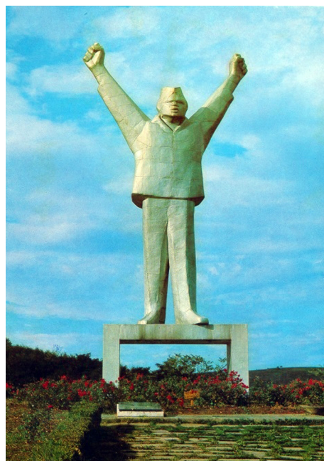
FIGURE 7: FIG. 7. VOJIN BAKIĆ, A CALL FOR AN UPRISING , BELGRADE, 1946-47 AND THE MONUMENT OF STEVAN FILIPOVIĆ , VALJEVO, 1960.

CONCLUSION The new government of the socialist federation legitimized itself based on the participation and the victory in the Second World War. The memory of the PLW and the killed fighters was the ideological platform (that is, operative ideology and educational symbolism), and the alive and useful participants were a part of the social organization. This way, the latent state of war continued; the new government had a lot of enemies, starting from local (counter-revolution, remains of the former system, sympathizers of the monarchy, national elite) up to global (break with USSR, capitalism from the West). There, the rule should be established and maintained over the whole territory, and broadly a whole new system should be built.