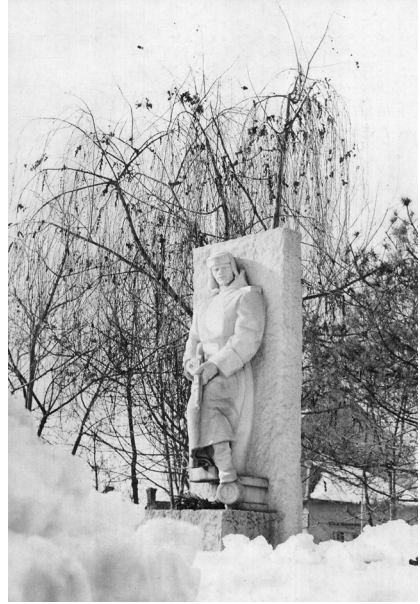
FIGURE 6: FIG. 6. ANTUN AVGUSTINČIĆ, MEMORIAL CEMETERY OF THE LIBERATORS OF BELGRADE, 20TH OCTOBER 1954.

grade on the occasion of 10 years from liberation of Belgrade, on the 20th October 1954. This is the first memorial complex done in Belgrade after the Second World War. The memorial cemetery is dedicated to Yugoslav and Soviet fighters killed in the battles for the liberation of Belgrade in October 1944. 1395 PLW and POJ (in Serbian POJ being Partizanski Odredi Jugoslavije , Partisan Detachments of Yugoslavia) fighters along with 818 fighters of the Red Army were buried here. 1 (Мирјанић, 1955, p. 511) The cemetery was built according to the project of the architect Branko Bon and