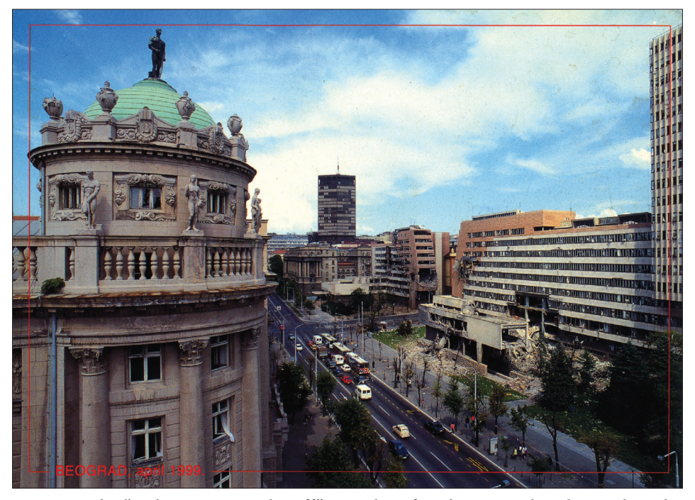
Figure 4. The "Dobrović General Staff" complex after the NATO bombing. postcard from 1999.