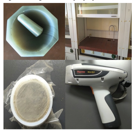
Figure 1. Diagram of sample preparation

plastic wrap. Powder samples were prepared in a fume hood at the Faculty of Pharmacy in Belgrade to eliminate excess dust that could contaminate other samples. Between the preparation of each sample, the mortar and the pestle were wiped with a disposable paper towel and distilled water (Fig. 1).