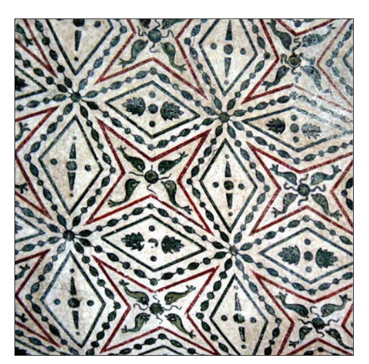
Fig. 6. Santa Constanza, Rome, vault, detail, 339–351

of time. While some of the surviving dolphin depictions decorate its ambulatory vault (Fig. 6), the frescoes in the dome of the church, where the dolphins were depicted in even greater numbers and in a different form, have been completely destroyed today. However, these frescoes are known today thanks to the drawings from a later period (Ringbom, 2003, p. 25, fig. 14; Gavrilović, 2022b, p. 78). Apart from the question of the religious orientation of the donor and some other still unresolved issues, it should be emphasized that the mosaics of the ambulatory vault with the motif of dolphins chasing octopuses are juxtaposed with the Bacchic cupids engaged in pressing grapes and harvest-