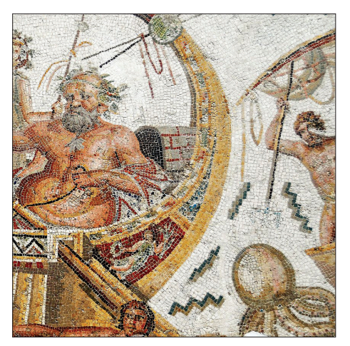
Fig. 4b. Dionysus epiphany at the sea, Dougga, detail of the central ship, dolphins and hippocamp