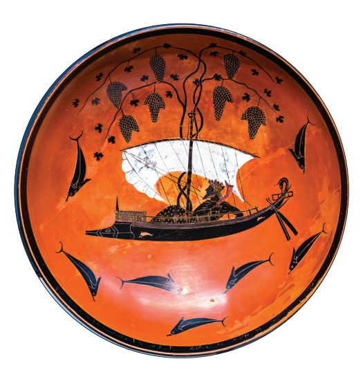
Fig. 3. Dionysus epiphany at the sea, Dionysus cup (Munich 2044), State Collections of Antiquities, Munich, 540–530 BC, detail