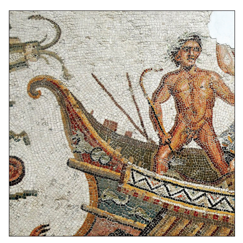
Fig. 4c. Dionysus epiphany at the sea, Dougga, detail of the central ship, goddess Nike (Victory)