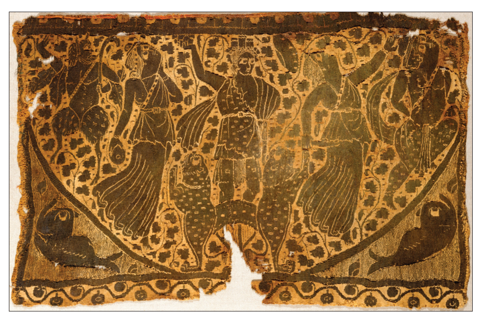
Fig. 5. Panel with the Triumph of Dionysus, 4th–6th century, Metropoliten Museum, New York

the feast of Anthesteria, the Athenian festival in honor of Dionysus (Henrichs, 1987, 110, n. 96). Based on the essential message of the Homeric hymn, the presence of numerous dolphins in the sea and the analogies with the dolphin motifs on Dionysus cup, that "decorate" the Dionysus ship on the Roman mosaic at Dougga, we are of the opinion that what Exekias depicted on the kylix is the epiphany of Dionysus at sea, which is also the opinion of numerous scholars.<sup>22</sup>