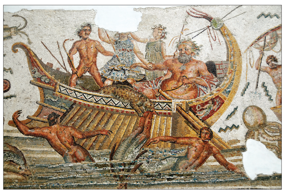
Fig. 4a. Dionysus epiphany at the sea, Roman Mosaic from the Bardo Museum, Dougga, mid-3rd century