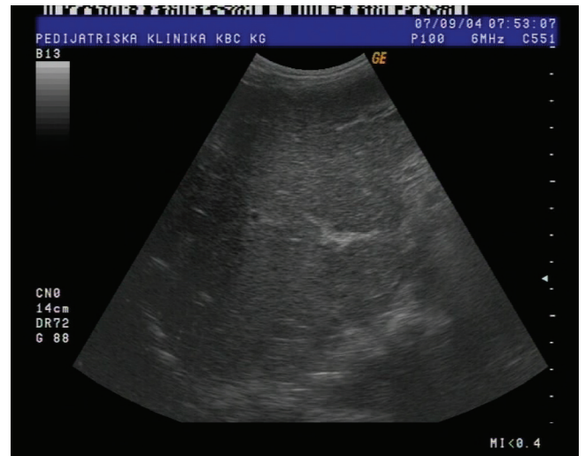
Figure 1. Ultrasound of irregular hepatic structure.

Personal anamnesis showed the patient was the first child from a normal, controlled pregnancy, with a birth weight of 3750 g, length of 56 cm and an APGAR score of 10. The patient was regularly vaccinated and fed adapted milk formula from birth. Due to the unclear etiology of conjugated hyperbilirubinemia in the neonatal age, a percutaneous liver biopsy was performed. Histopathological examination showed gigantocellular transformation of hepatocytes and an initial fibrous process with signs of centrilobular cholestasis. Echosonography findings of the extrahepatic biliary tract were normal, while left kidney cystic changes were noted. A percutaneous liver biopsy was repeated at the age of 9 months because of persistent cholestasis. Histopathological examination of the percutaneous liver biopsy confirmed diffuse fibrosis with proliferation of irregular and branched bile capillaries (ductal plate malformation). Abdominal ultrasound and CT examination showed an easily enlarged liver and hyperechoic parenchyma with periodic beaches of normal tissue transonicity. Gallbladder and bile ducts appeared normal.